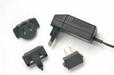
Worldwide compatible AC adapter/charger (SNT-121A)