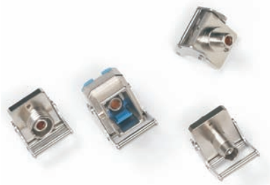
Optical adapters (BN 2150) for signal input