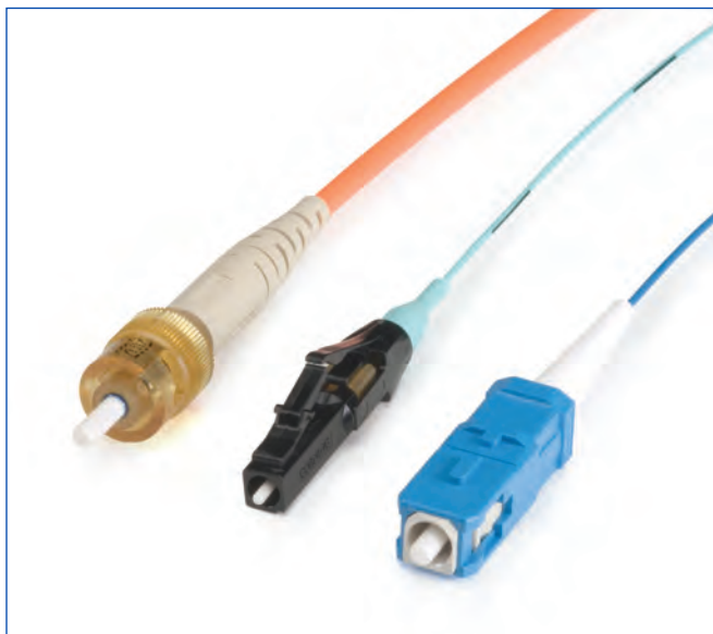
UniCam High-Performance Multimode Connectors | Photo LAN772

Corning Cable Systems UniCam® High-Performance Connectors offer best-in-class optical performance in a fast, easy field-termination solution. These high-precision ceramic ferrule connectors guarantee exceptional insert loss – 0.1 dB typical/0.5 dB maximum per connector pair for multimode, 0.2 dB typical/0.5 dB maximum per connector pair for single-mode. Installation of an LC, SC, or ST® Compatible Connector can be accomplished in about 45 seconds with the UniCam Tool Kit. The lightweight, handheld installation tool and the high-performance cleaver virtually eliminate human variability from installation, ensuring terminations are right, the first time, every time. This kit was designed with consideration for the network installers, from the cleaver, with its integrated fiber scrap bin and dual-clamp precision hold, to the installation tool, with its immediate go/no-go feedback signal. Installation is as easy as strip, clean, cleave, cam and crimp, with exceptional optical performance guaranteed. Every UniCam Connector is guaranteed to meet the published specification at the time of installation or Corning Cable Systems will replace it.