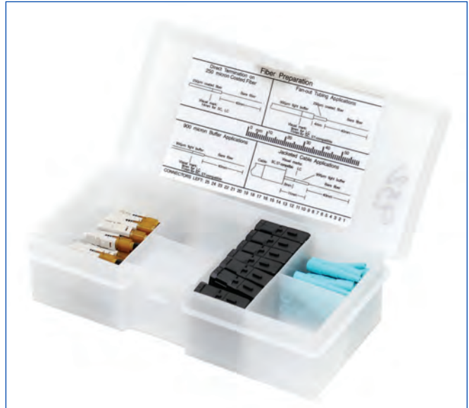
UniCam Z-Pak Organizer | Photo LAN1676