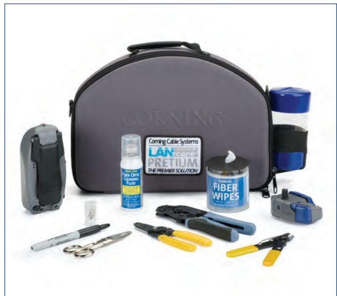
UniCam High-Performance Tool Kit | Photo LAN769