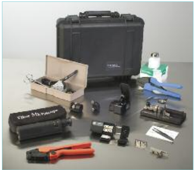
UniCam MTP Connector Installation Tool Kit | Photo LAN598