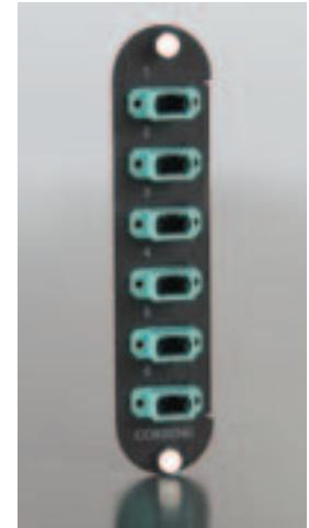
72-Fiber MTP® Connector Panel | Photo LAN659