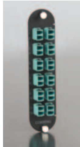
24-Fiber LC Duplex Connector | Photo LAN661