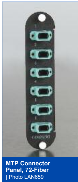
MTP Connector Panel, 72-Fiber | Photo LAN659