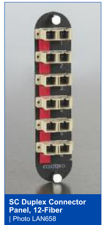
SC Duplex Connector Panel, 12-Fiber | Photo LAN658