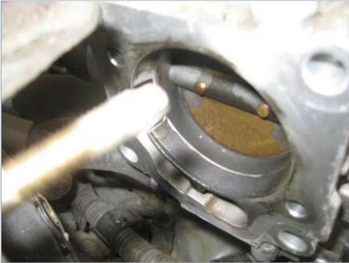
Output side of throttle body. Much dirtier. Probably ought to clean it at some point but didn't have the time today. ManifoldGasket 016.jpg (20.69 KiB) Viewed 6119 times

by biodieselrabbit » Sun Jan 06, 2013 5:24 pm