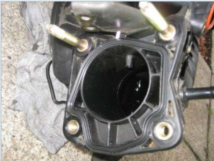
New throttle body gasket (Toyota Part #22271-0D030). The old one was likely fine but since I was taking it off anyway might as well put in a nice new one given the relatively low cost. ManifoldGasket 027.jpg (30.17 KiB) Viewed 6118 times

by biodieselrabbitt » Sun Jan 06, 2013 5:38 pm