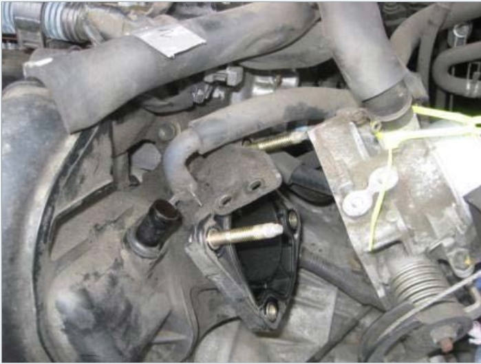
Throttle body removed and tied out of the way. I did not detach any vacuum hoses or radiator fluid lines from the throttle body.

ManifoldGasket 015.jpg (29.15 KiB) Viewed 6119 times