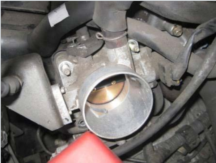
Input side of throttle body after removing the rubber hose (snorkel) from air box. Very clean. ManifoldGasket 014.jpg (25.68 KiB) Viewed 6119 times

Last edited by biodieselrabbit on Sun Jan 06, 2013 5:44 pm, edited 1 time in total.