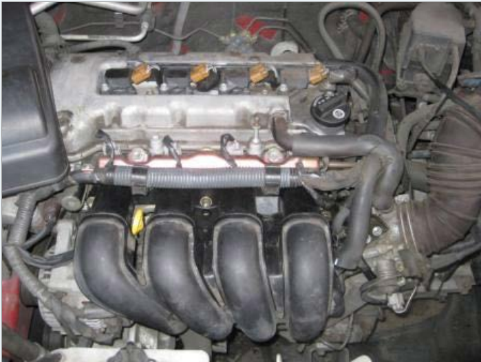
Reassembled Engine. ManifoldGasket 029.jpg (30.59 KiB) Viewed 6118 times