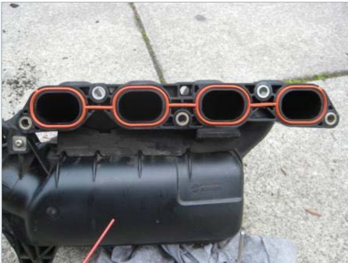
New intake manifold gasket (Toyota Part #17171-22060). Notice how it is the burnt orange color. ManifoldGasket 026.jpg (27.66 KiB) Viewed 6118 times