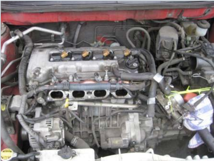
Whole engine bay with intake manifold removed.

by biodieselrabbitt » Sun Jan 06, 2013 5:28 pm