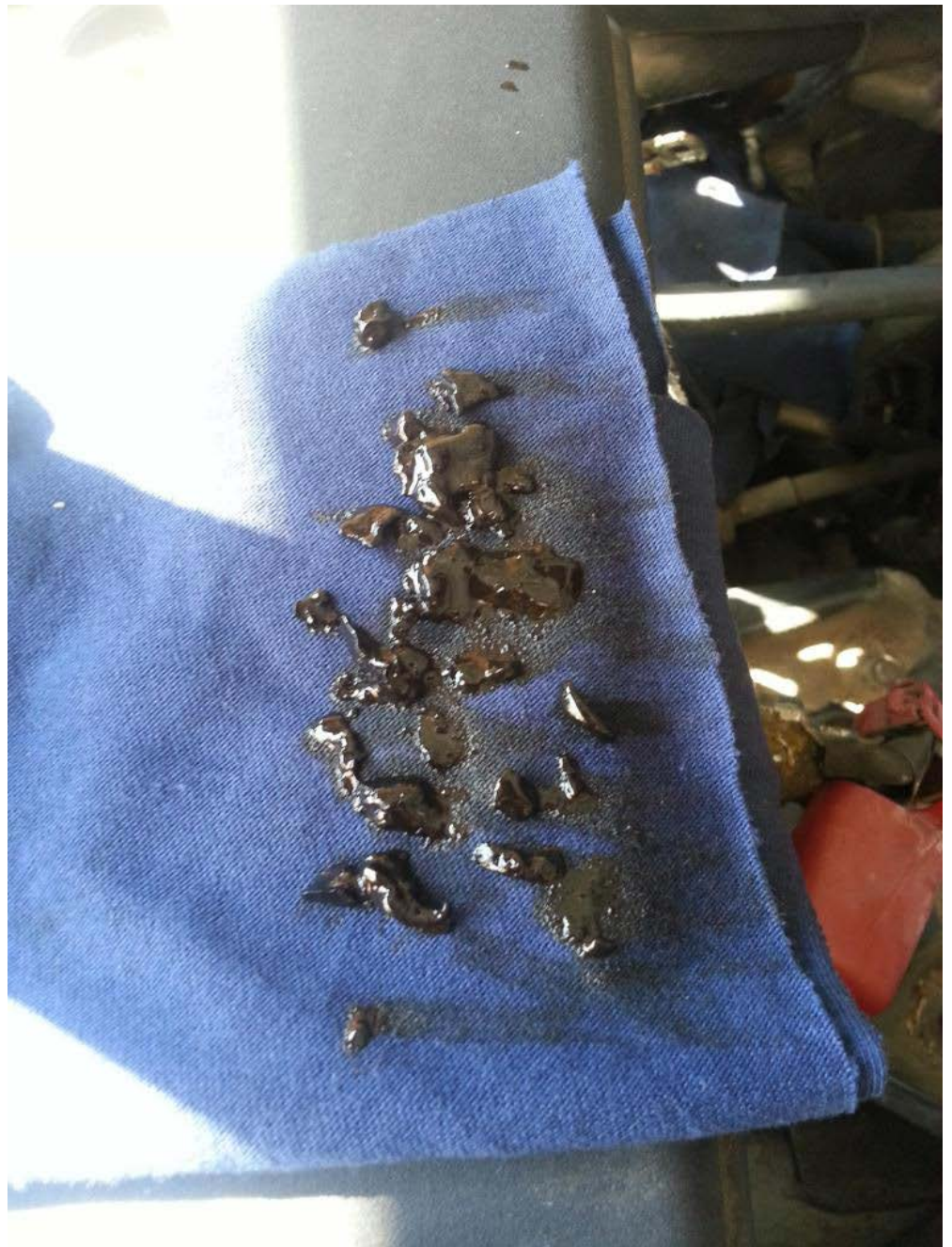
the vvtl-i ocv housing...