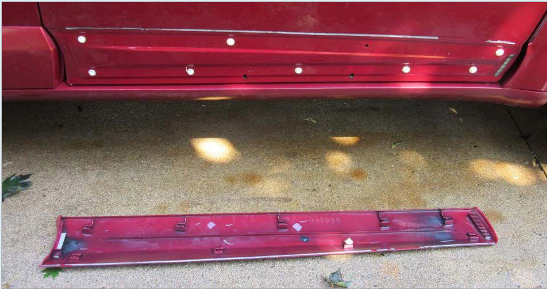
Vibe door and cladding cropped.jpg (110.35 KiB) Viewed 471 times

Remove the cover film from the molding tape, line up the molding with the holes in the door and pop it into place. Go around the perimeter and press the molding to the door to make sure the tape grabs everywhere and all fasteners are seated.