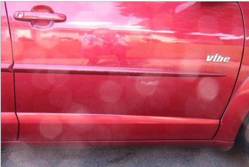
Vibe door cladding, done.jpg (43.86 KiB) Viewed 470 times