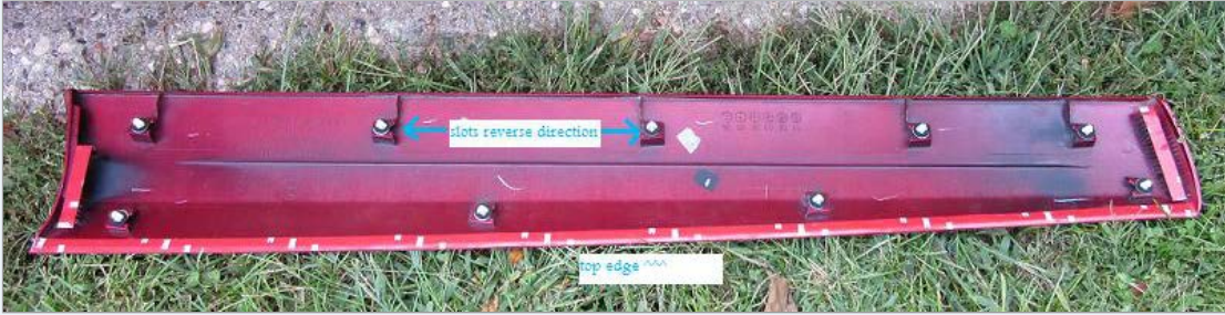
Vibe door cladding with tape and fasteners.jpg (72.97 KiB) Viewed 470 times