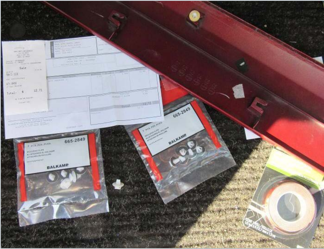
Vibe door cladding supplies.jpg (118.67 KiB) Viewed 471 times

Last edited by vibrologist on Mon Sep 07, 2015 7:33 am, edited 2 times in total.