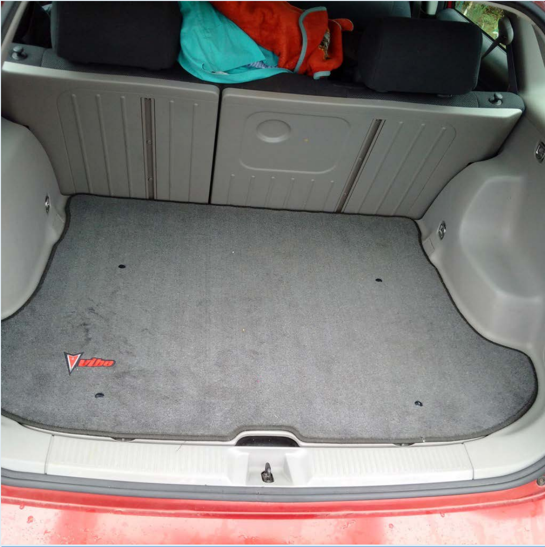
Me, my Vibe, and the open road...

by vibrologist » Fri Apr 03, 2015 8:01 am