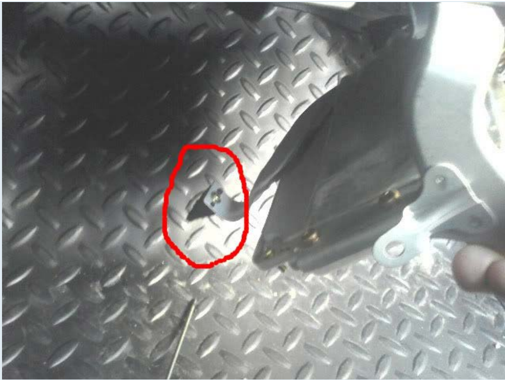
Step 5 Remove The Blower motor. Disconnect wiring harness on bottom, Disconnect rubber drain tube and remove three 5.5mm screws. Now just lower out.