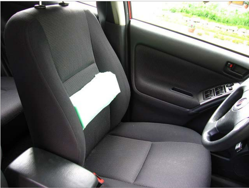
testing positions.JPG (126.2 KiB) Viewed 926 times

Last edited by vibrologist on Tue Jun 10, 2014 5:35 pm, edited 2 times in total.