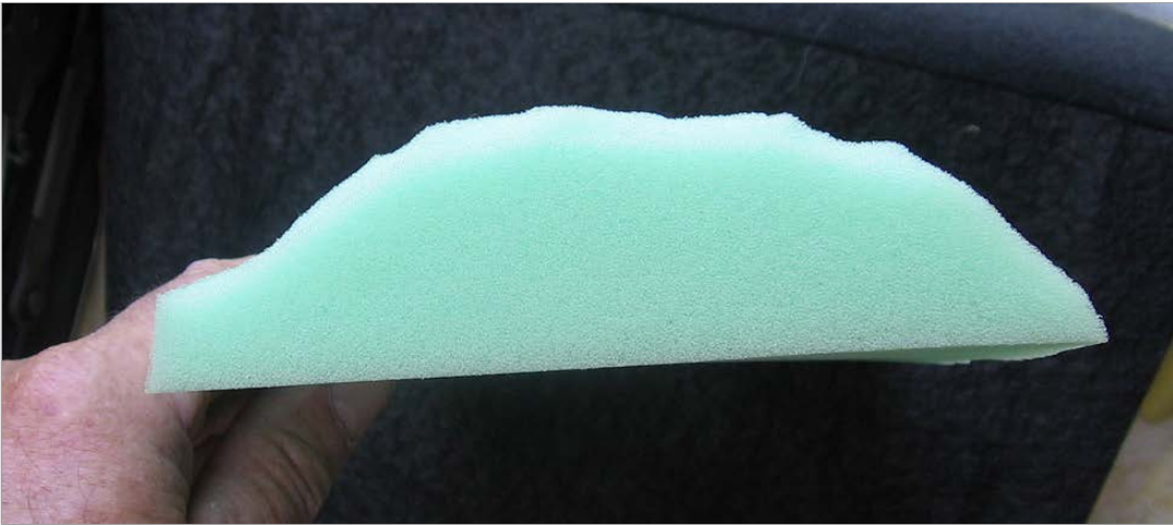
foam profile.JPG (122.83 KiB) Viewed 926 times