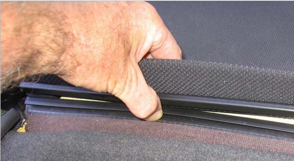
J-hooks.JPG (121.43 KiB) Viewed 924 times