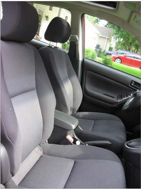
looks factory.JPG (100.49 KiB) Viewed 924 times