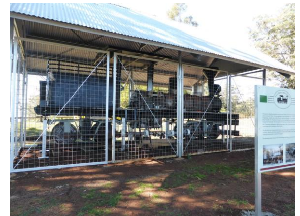
The Shay at Ravensbourne