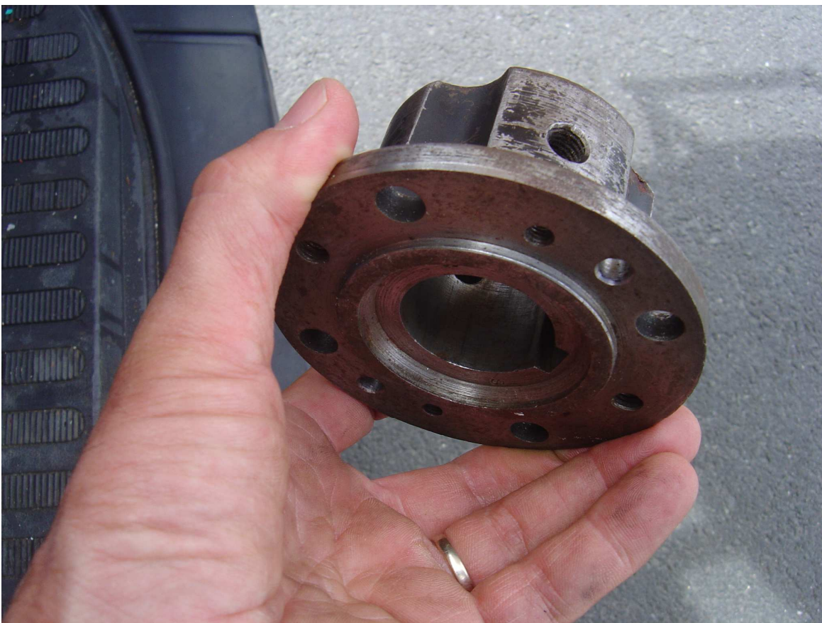
Fixed coupling used as a tool for centering both shafts