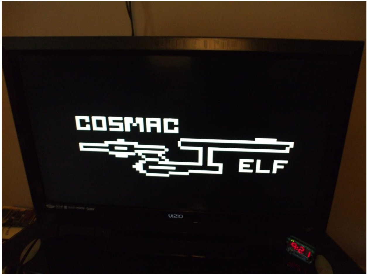
Resolution 64 by 32