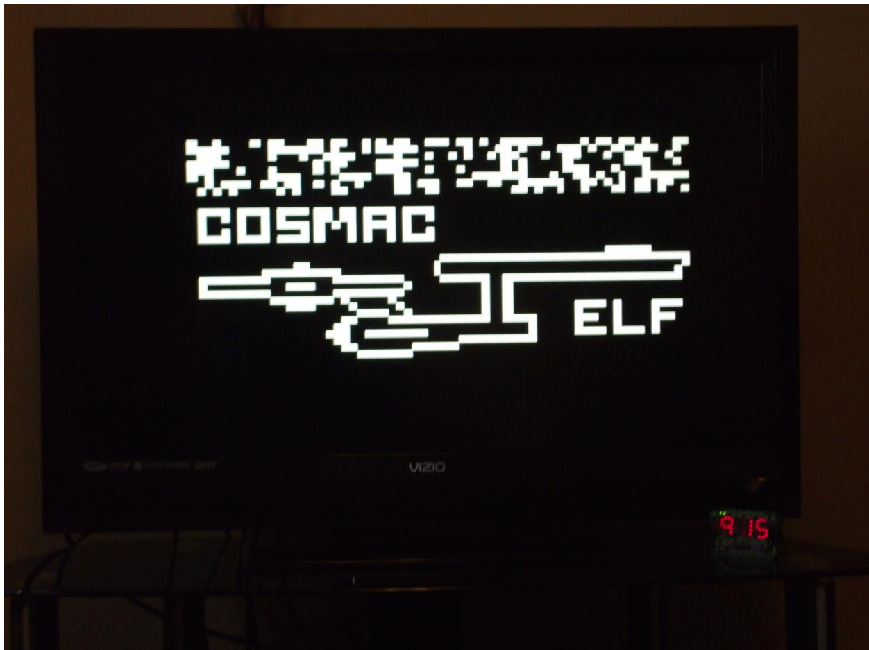
Running the Pixie Starship Program

Here are some screen shots of the CDP1861 Rev. E circuit operating.