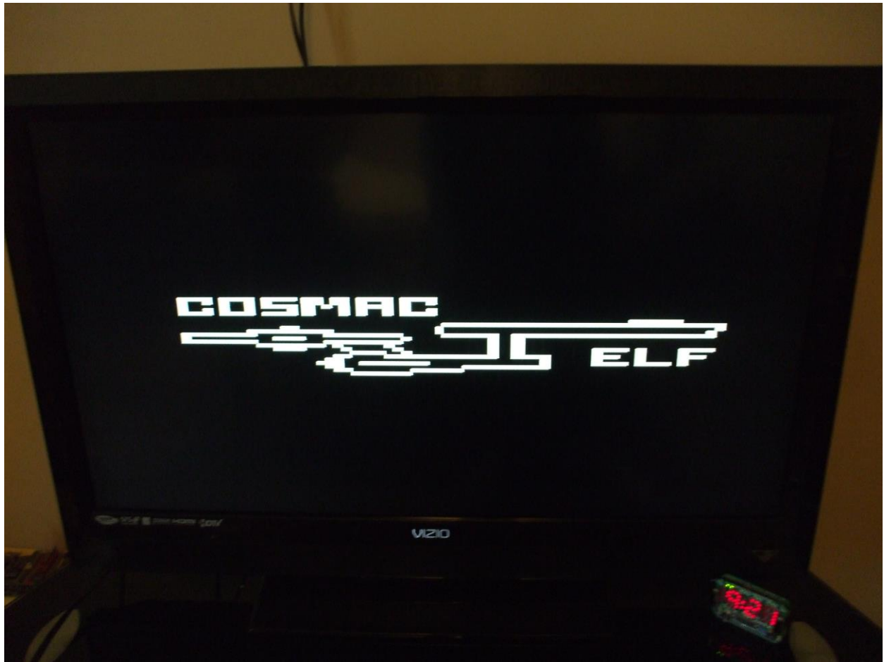
Resolution 64 by 64