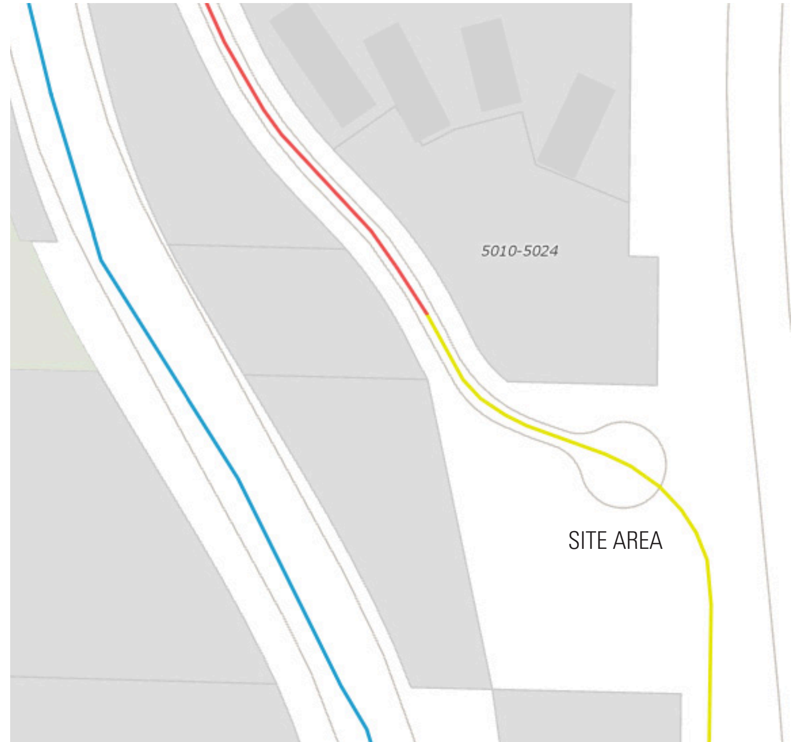
STREET OVERLAY- PORTLAND MAPS