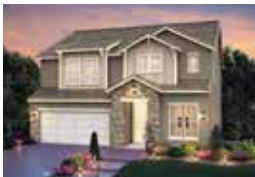
HANNAH* - 2,366 SQ. FT. 3-5 Bedrooms • 2.5-3 Baths • 2-3 Car Garage

Model Home at Copper River Ranch, Belterra and La Ventana