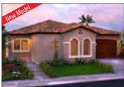
SOFIE - 2,550-2,806 SQ. FT. 3-5 Bedrooms • 3-4 Baths • 2-3 Car Garage

Showcase Home coming soon to Copper River Ranch