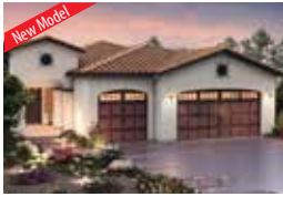
MOLLY - 1,970 SQ. FT. 3-4 Bedrooms • 2 Baths • 3-Car Garage

See agents for locations of model showcase home