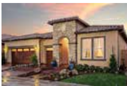
BELLA** - 2,600-2,830 SQ. FT. 4-6 Bedrooms • 3 Baths • 2-3 Car Garage

Showcase Home coming soon to Copper River Ranch