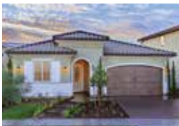
BIJOU - 2,207 SQ. FT. 3-4 Bedrooms • 2-3 Baths • 2-4 Car Garage

Model Home at Copper River Ranch, and Belterra