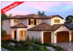
ZOIE - 2,675 SQ. FT. 3-4 Bedrooms • 2.5-3.5 Baths • 3 Car Garage

Showcase Home coming soon to Copper River Ranch