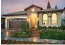
PASATIEMPO - 2,032 SQ. FT. 3-4 Bedrooms • 2-2.5 Baths • 2-3 Car Garage

See agents for locations of model showcase home