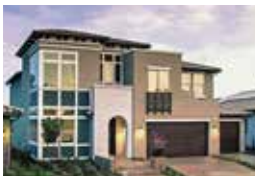
TRESOR* - 3,104 SQ. FT. 4-5 Bedrooms • 3.5-4.5 Baths • 2-3 Car Garage

Model Home at Belterra and Copper River Ranch