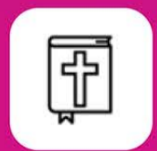
Bible Verse Lookup