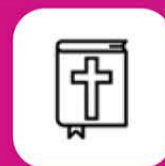
Bible Verse Lookup