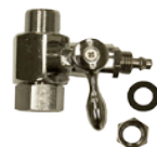
Water Diverter Valve