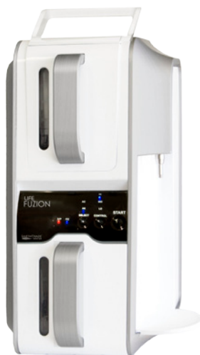
LIFE FUZION™ Portable Ionizer