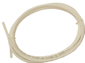
1/4 inch line