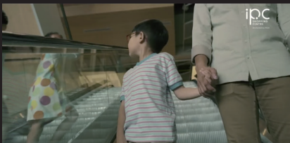
ONCE UPON SIGHT (Commercial) IPC