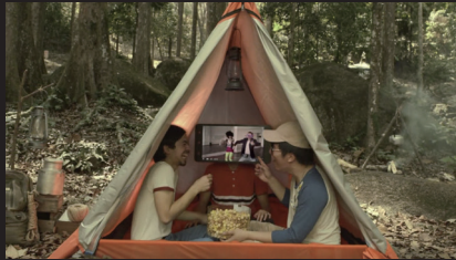
ZERO TO HERO (Commercial) U Mobile