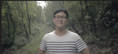
THE WATER MAN (Commercial) Coway