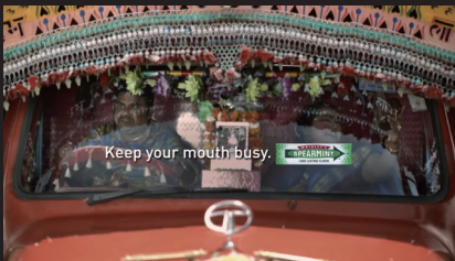
KEEP YOUR MOUTH BUSY (Commercial) Wrigley's