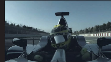
MISSION INCREDIBLE (Commercial) Petronas F1