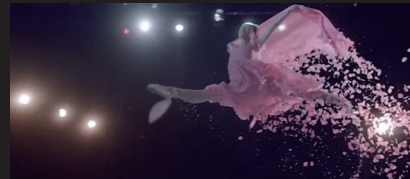
SWAN LAKE (Commercial) Softlan