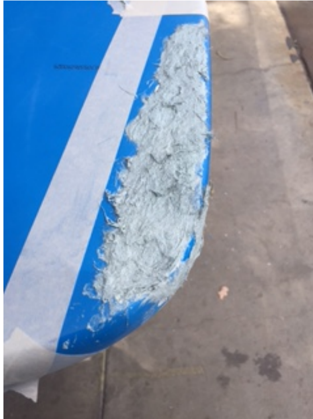
Post step 4 after applying the Epoxy filler fiber mix to the bottom.