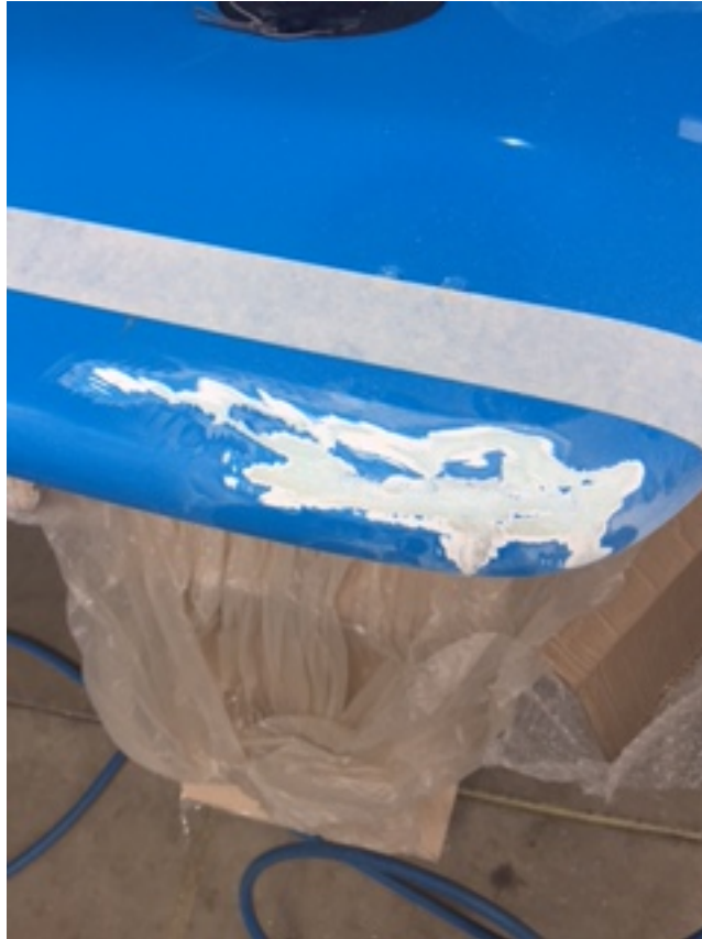
Repair area after grinding.