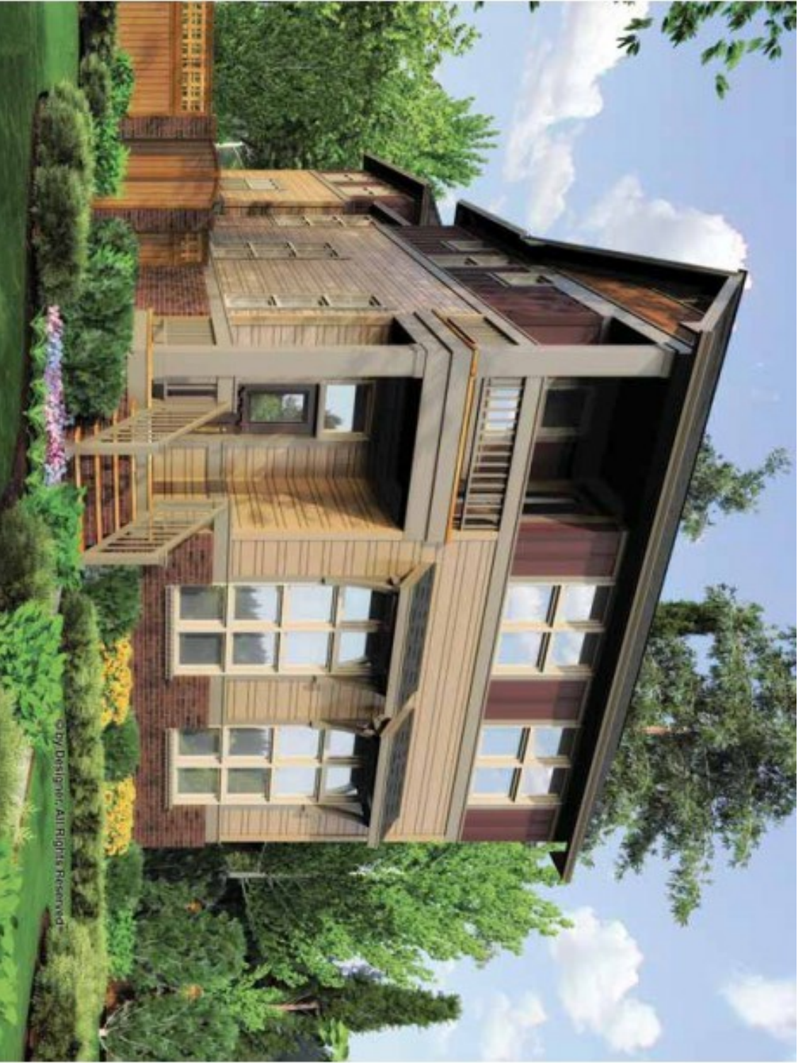
Similar to Photo