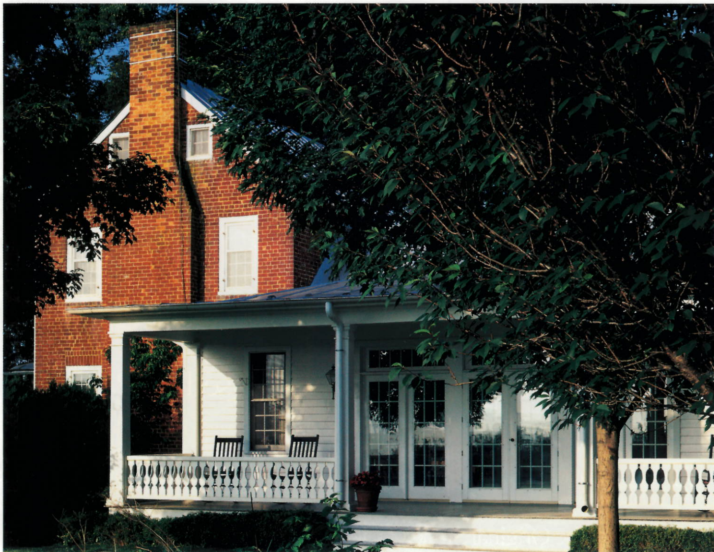
Frazier Associates blends old and new seamlessly in this porch addition on a nineteenth-century farmhouse in Virginia's Shenandoah Valley.

A porch addition to an 1810 Virginia Federal knits together new and old.