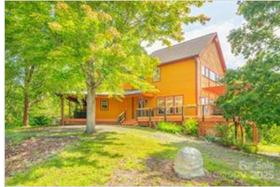
Freshly Painted Exterior