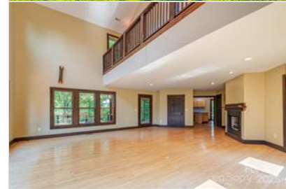
20ft Cathedral Ceiling