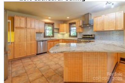
Luxury Granite Countertops