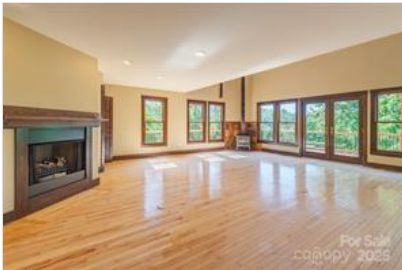
Vented Gas Fireplace