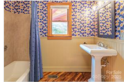
Main Floor Bathroom