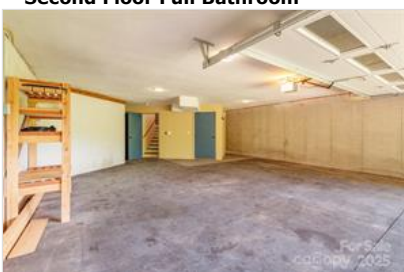
2 Car Garage