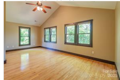
Second Floor Bedroom No 2