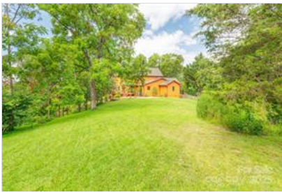
Fully Fenced Back Yard