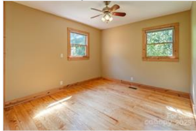
Main Floor Bonus Room