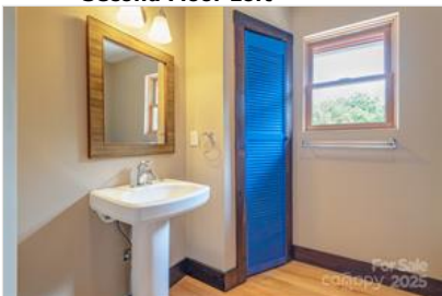
Second Floor Full Bathroom