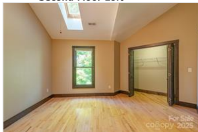
Second Floor Bedroom No 3