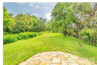
Fully Fenced Back Yard