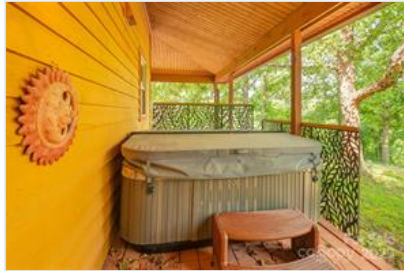
Hot Tub installed less than 4 years