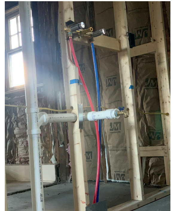
FRESH PLUMBING THROUGHOUT ENTIRE HOUSE