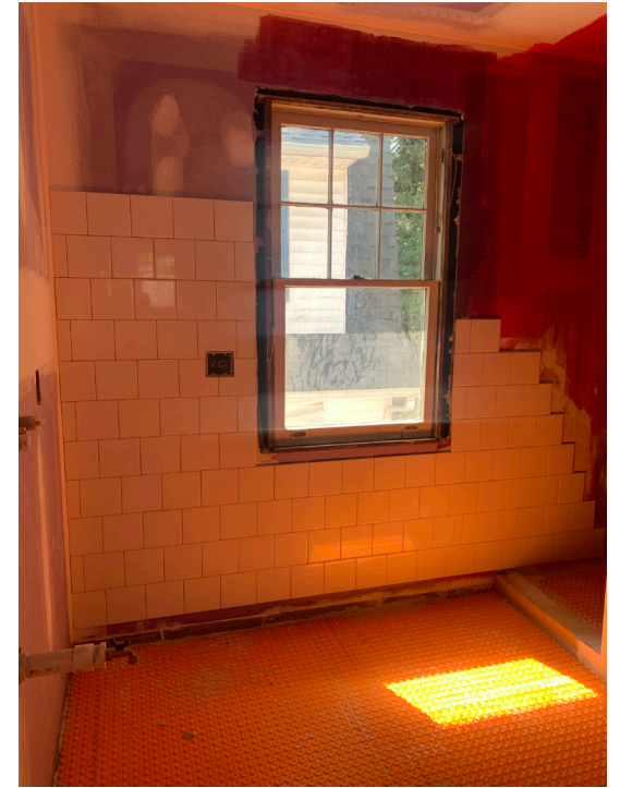
TILE UNDERLAYMENTS AND UPGRADES