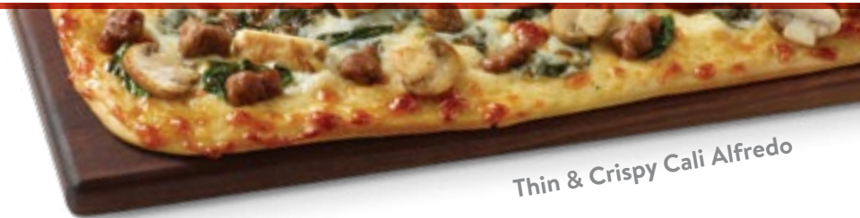
Thin & Crispy Cali Alfredo