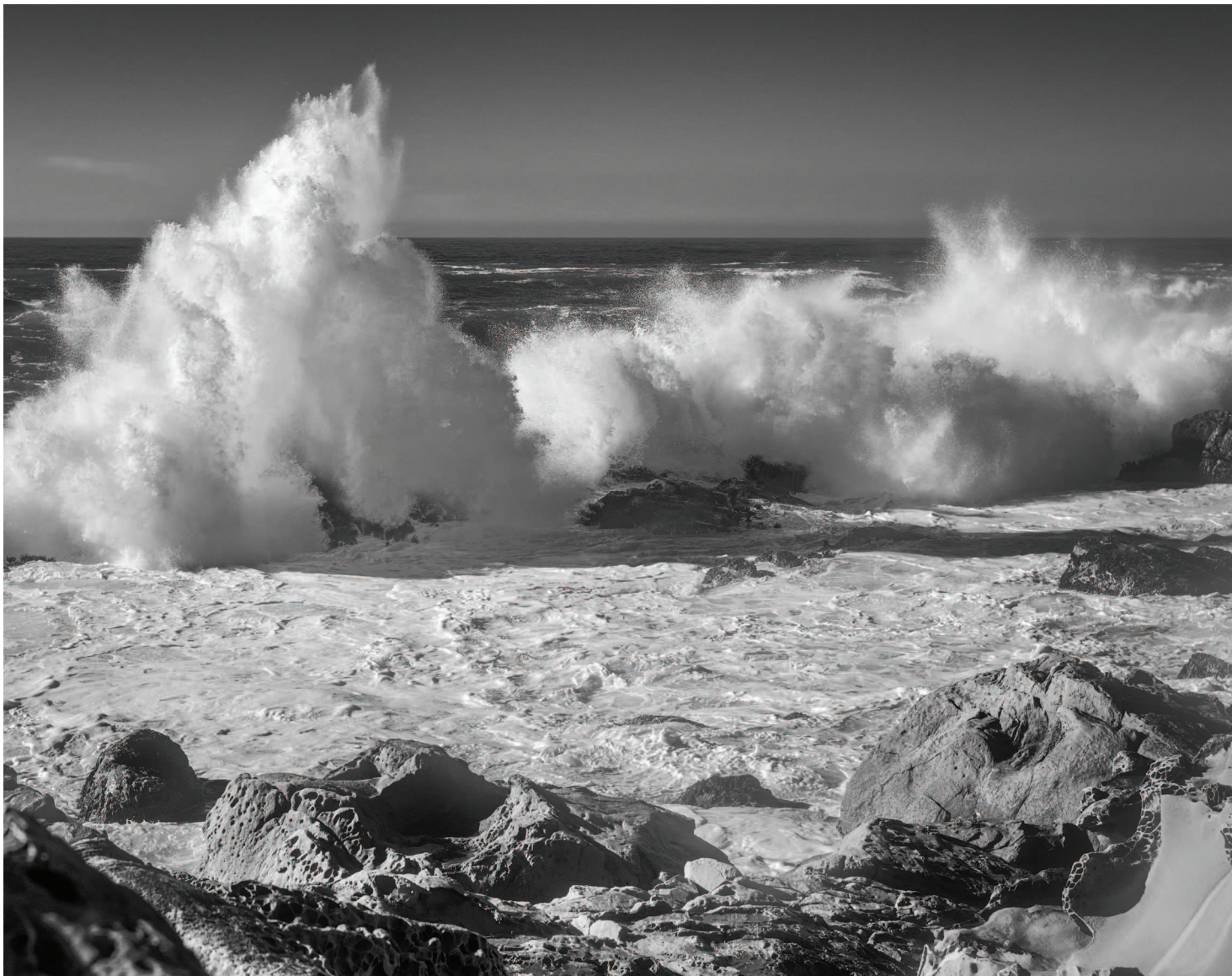
Crashing Wave No. 6, Sonoma, 2015