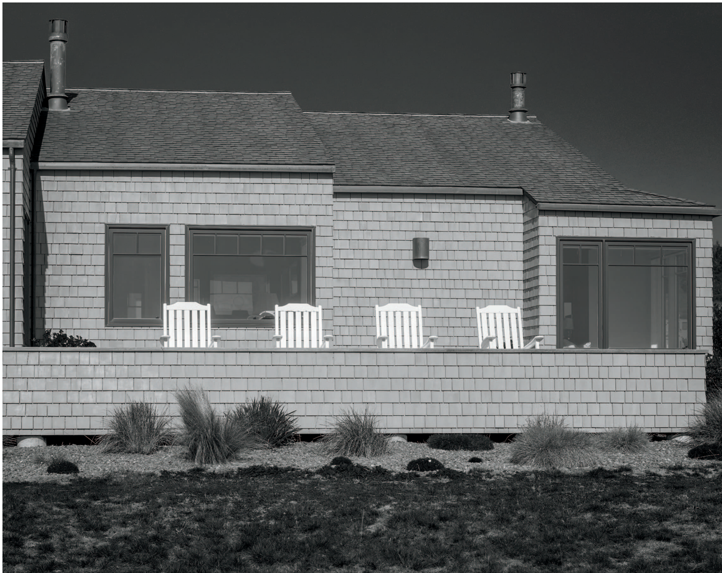
Four Chairs, Sea Ranch, 2015