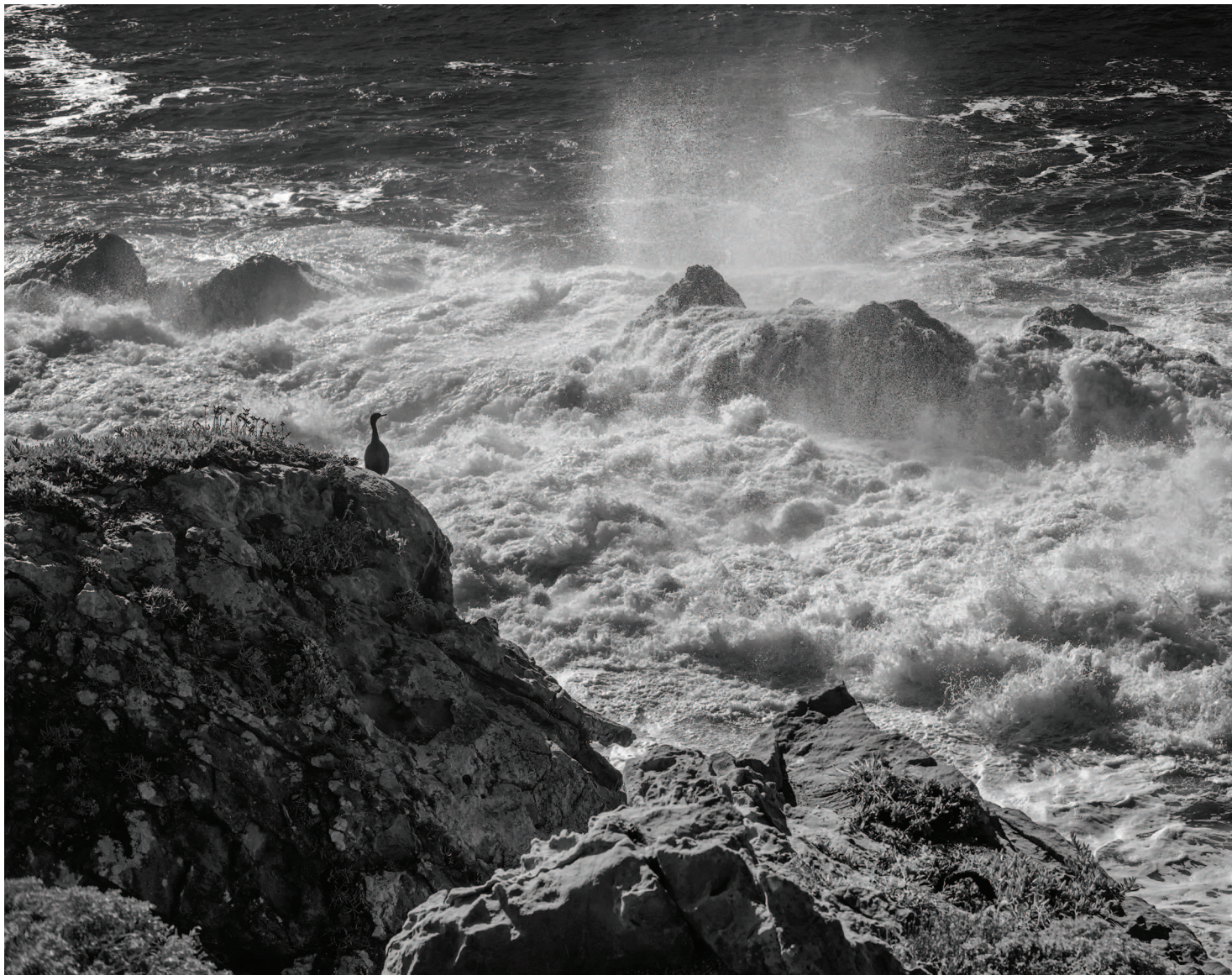
After the Crash, Sonoma, 2015