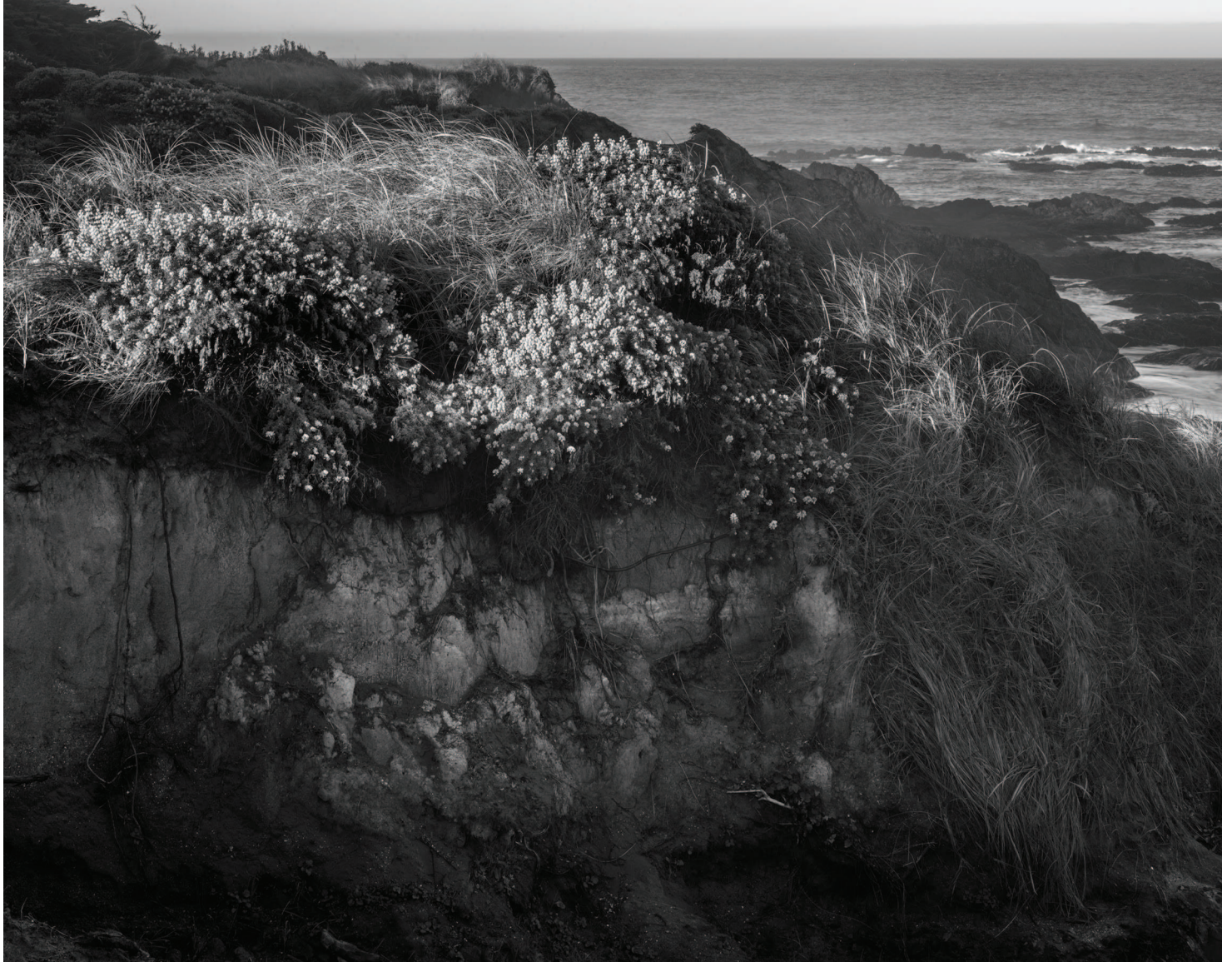
Near Del Mar Point No. 2, Sea Ranch, 2017