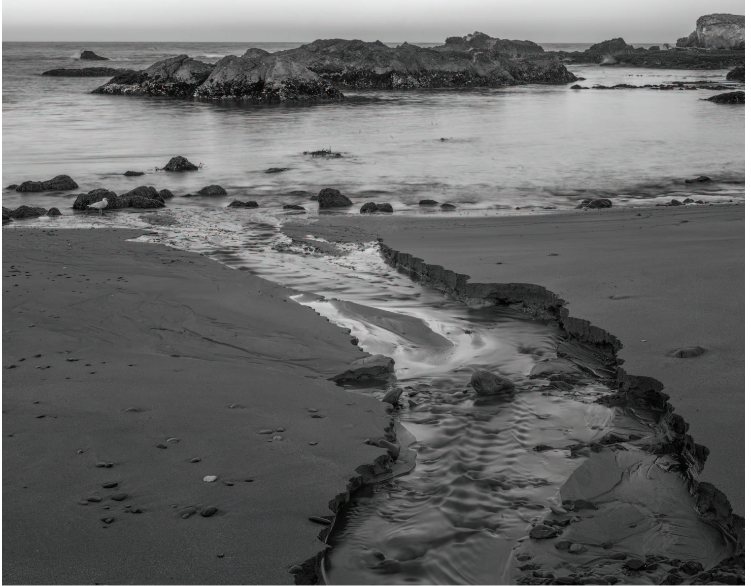
Shell Beach at Sunrise No. 4, 2019