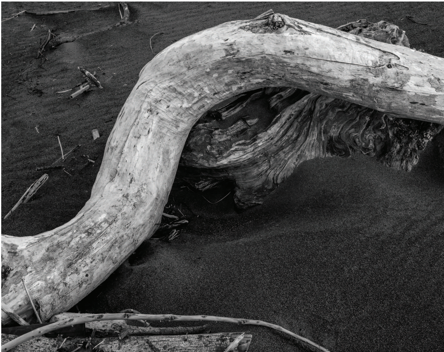
Driftwood, Shell Beach, 2019