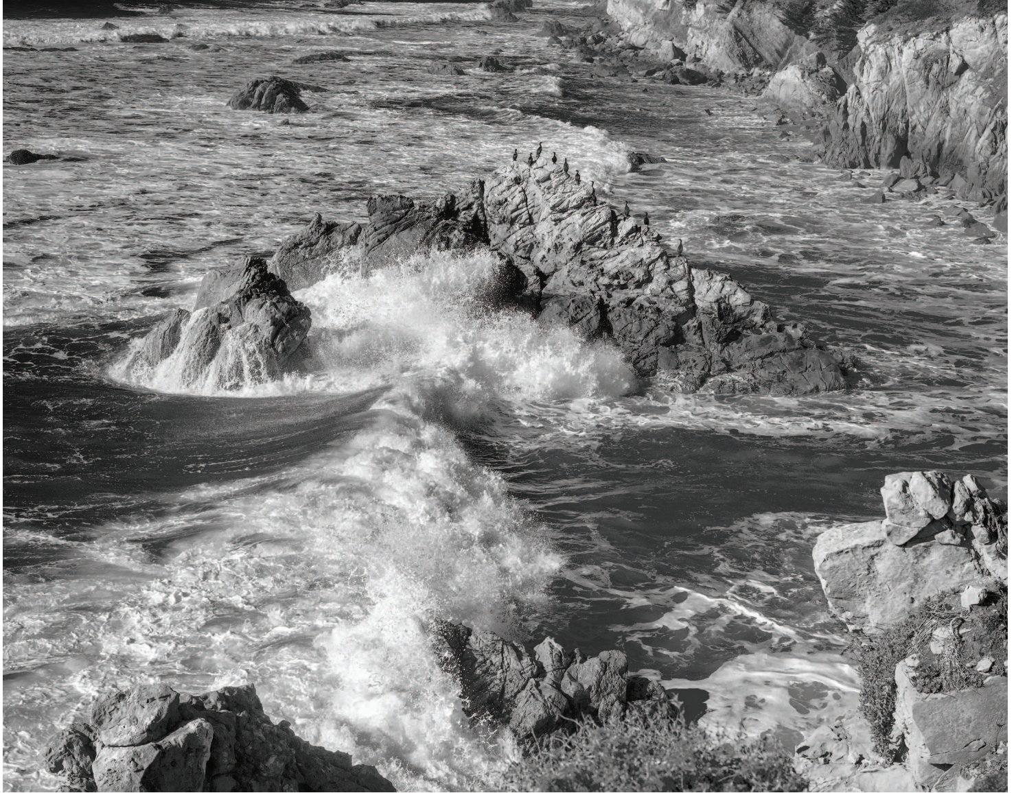
Near Del Mar Point No. 3, Sea Ranch, 2015