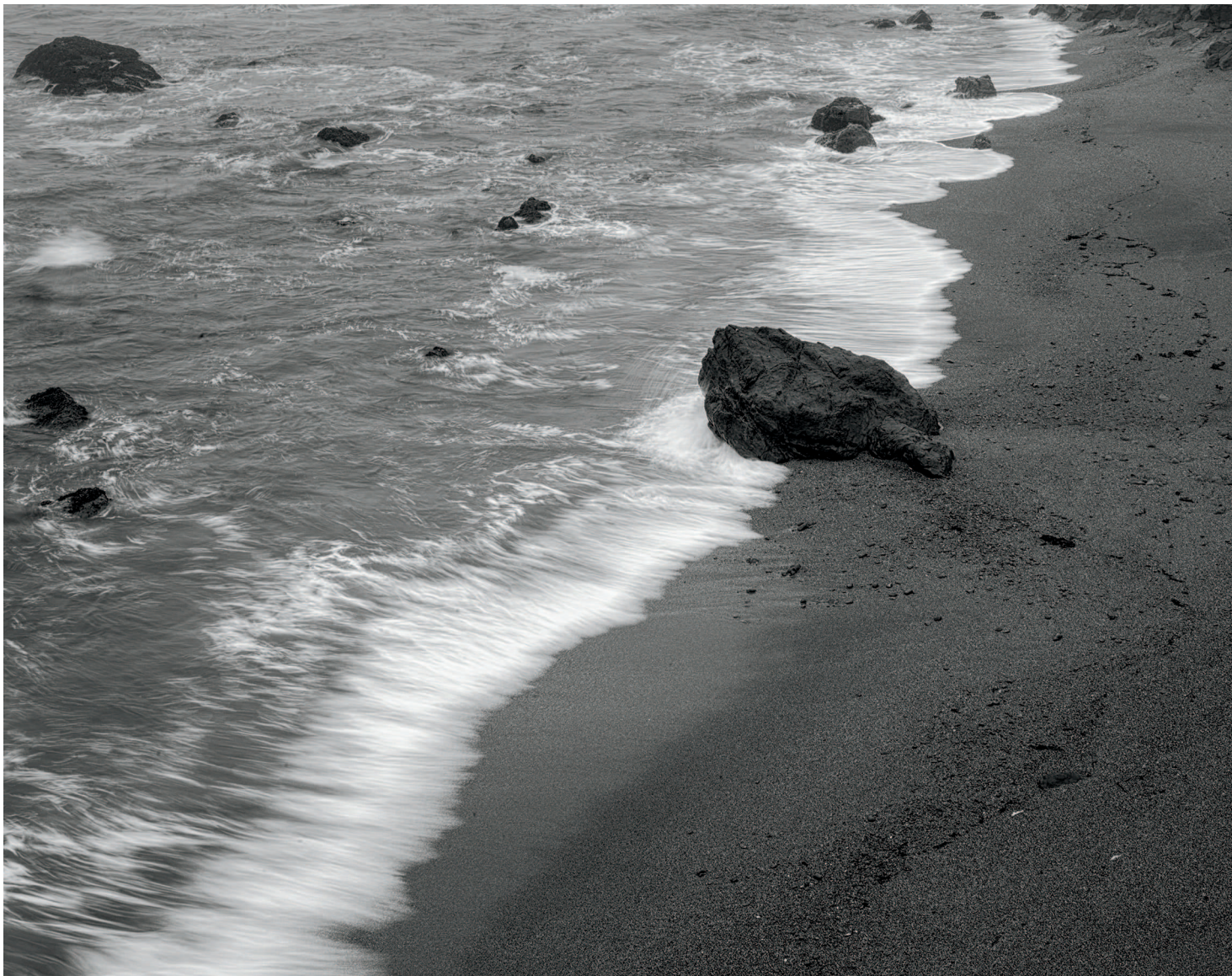
Carmet Beach No. 3, Sonoma County, 2019