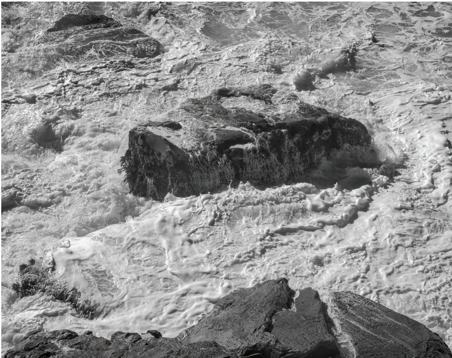
Receding Wave No. 3, Sonoma, 2015