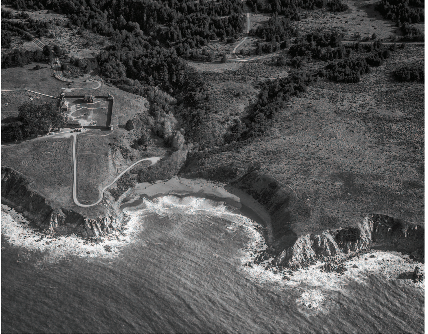
Fort Ross, Sonoma, 2015