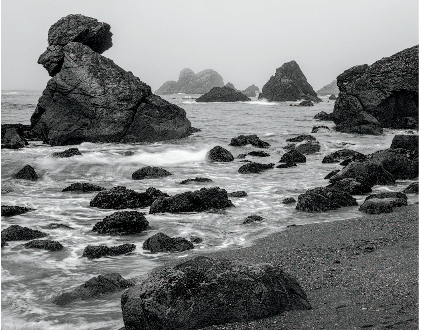
Near Rocky Point Beach No. 3, Sonoma County, 2019