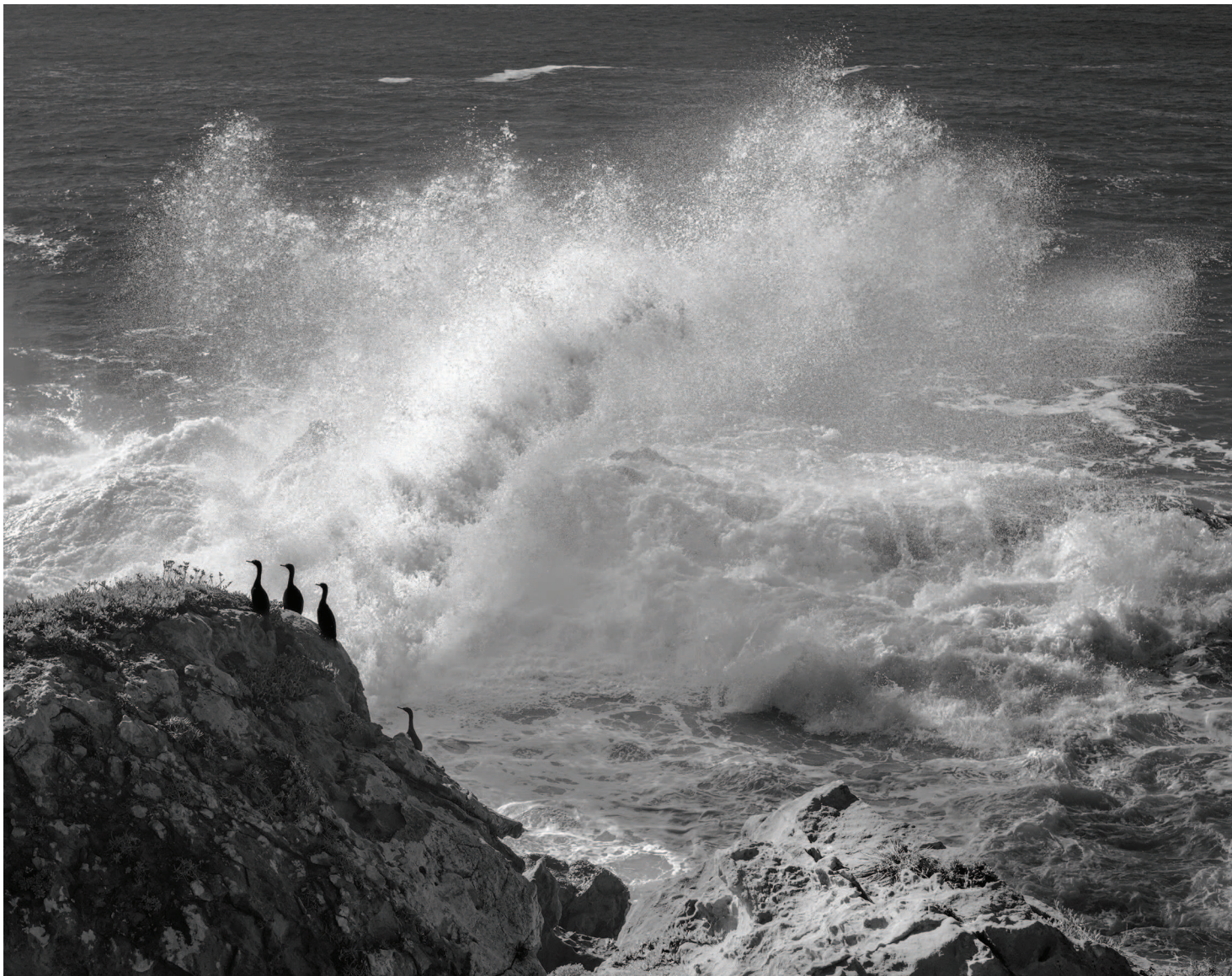
Cormorants No. 1, Sonoma Coast, 2015