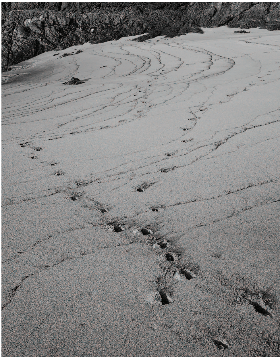
Deer Tracks in the Sand, Shell Beach, 2019