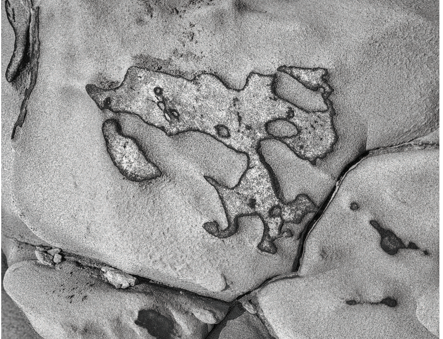
Eroded Sandstone No. 5, Sonoma, 2015