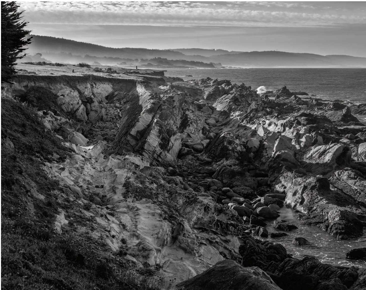
Del Mar Point, Sea Ranch, 2017