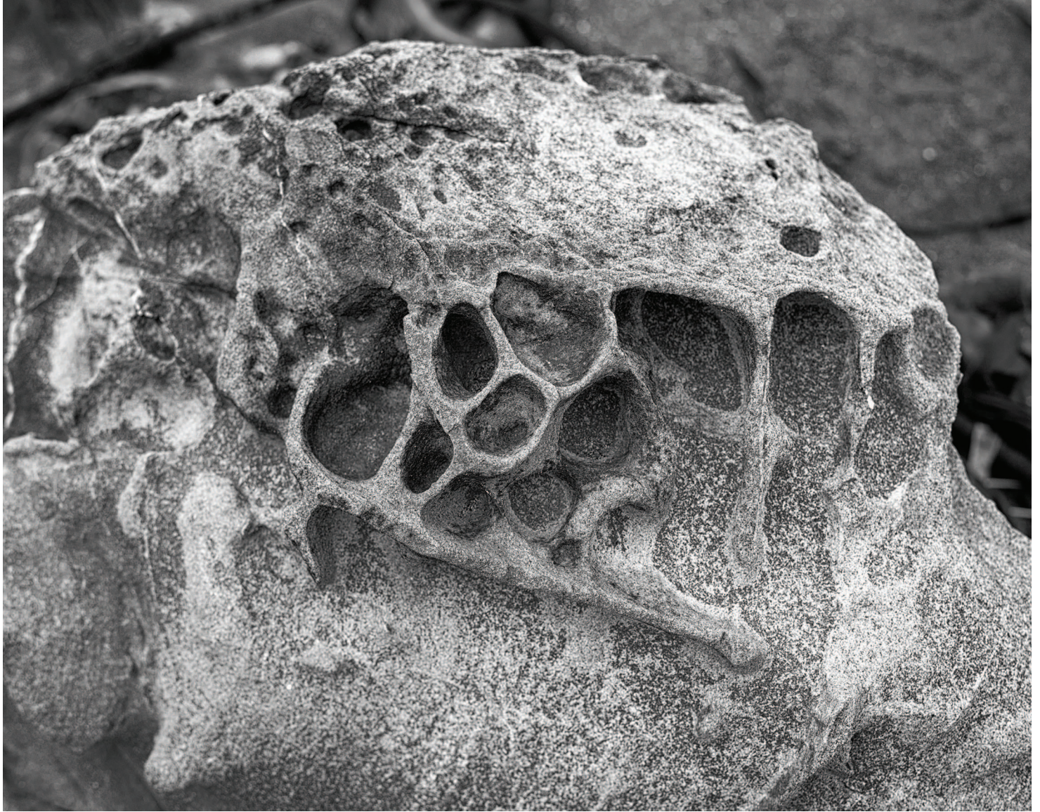
Eroded Sandstone No. 2, Sea Ranch, 2015