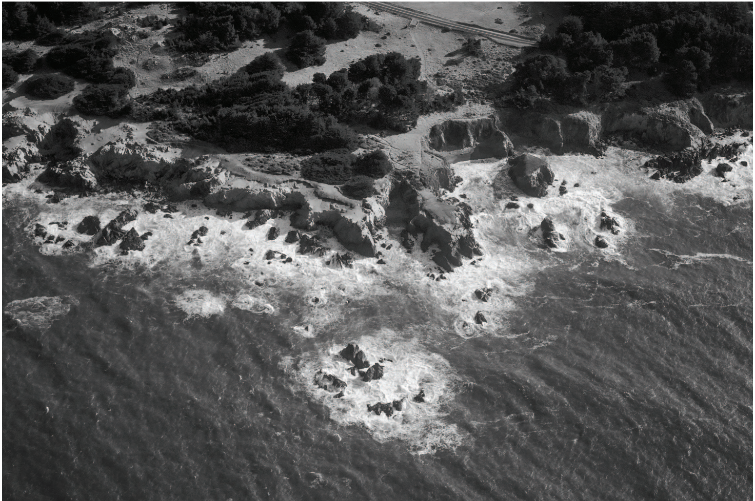
Crashing Surf No. 3, Sonoma Coast, 2015