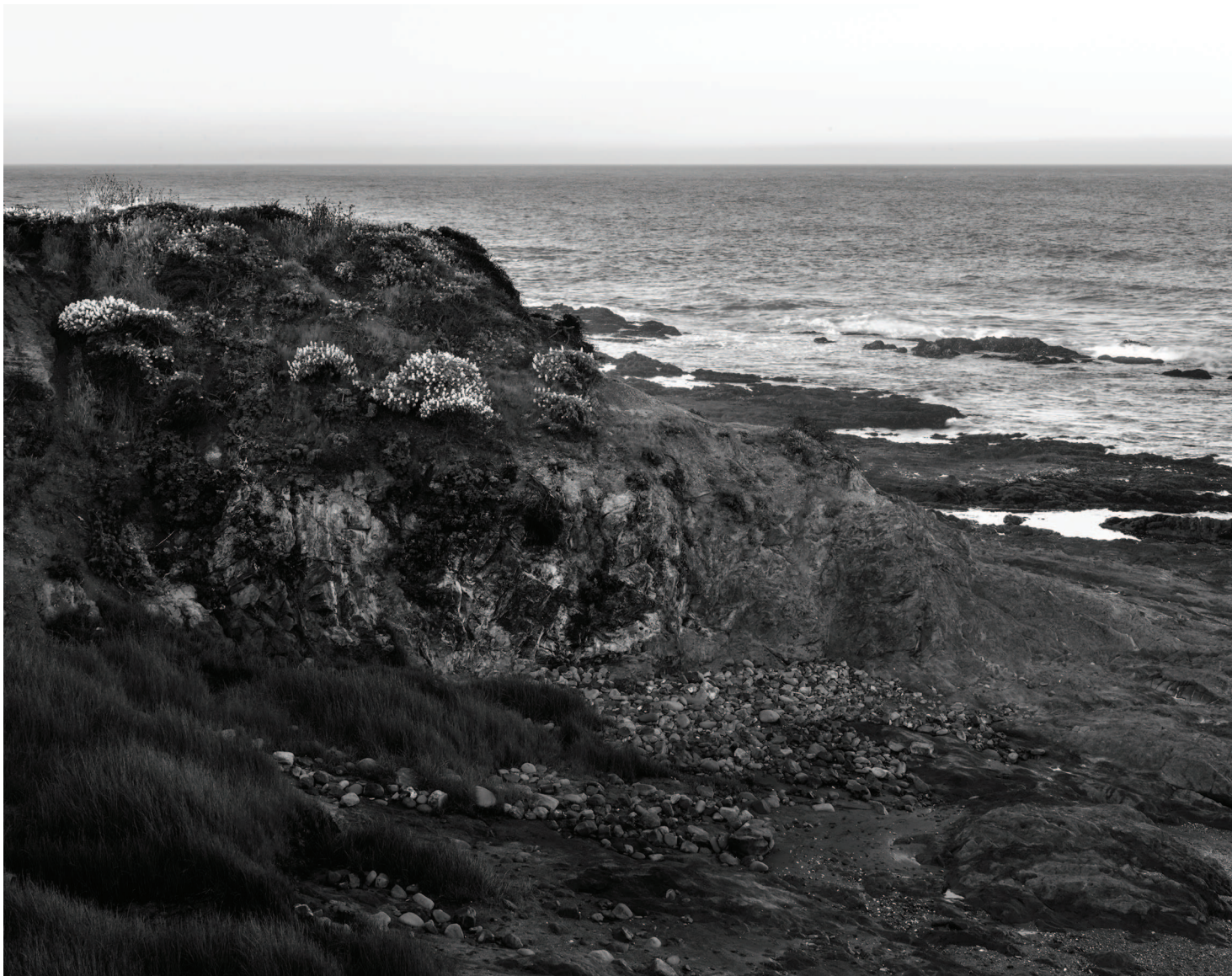
Near Del Mar Point No. 1, Sea Ranch, 2017