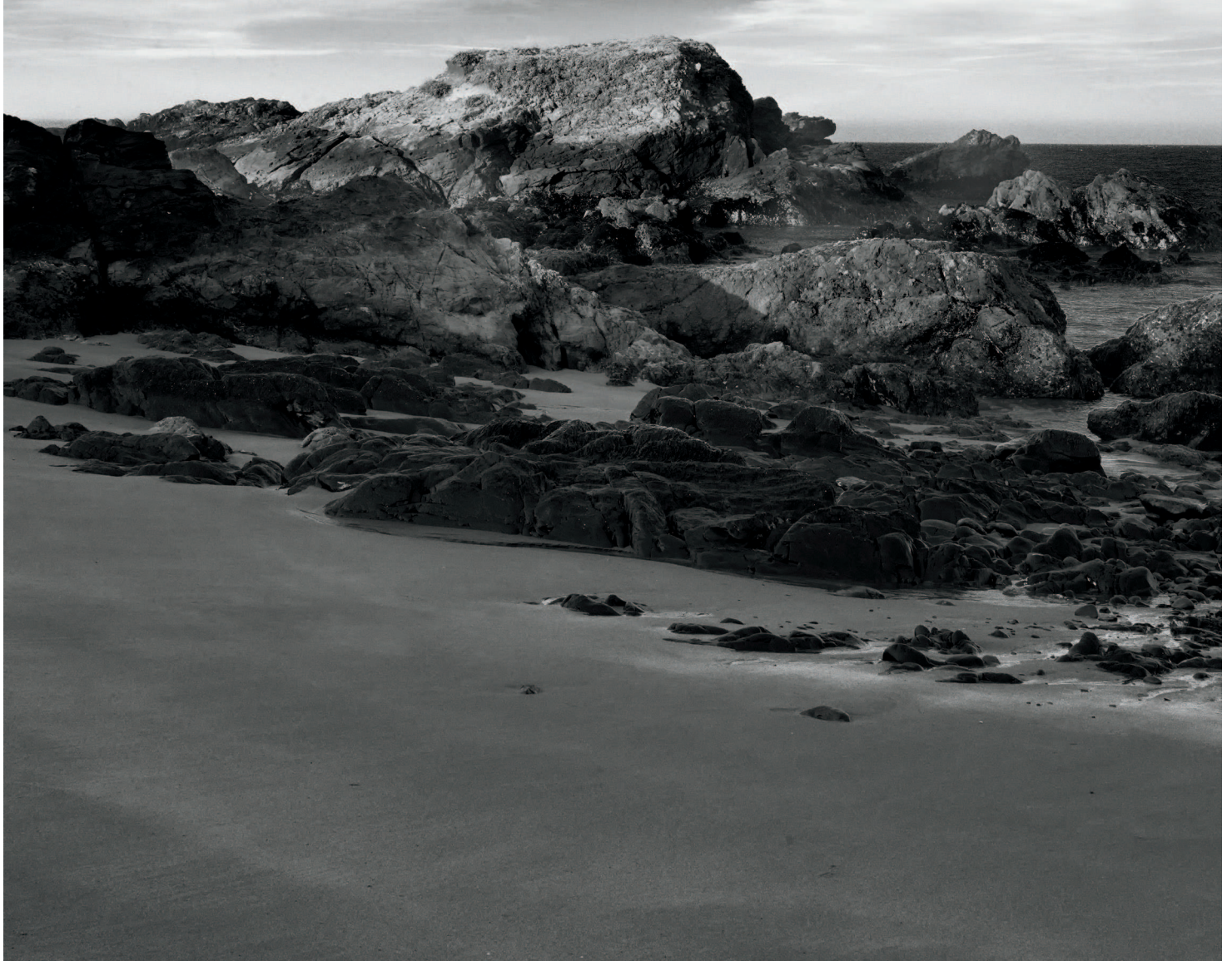
First Light No. 2, Shell Beach, 2019