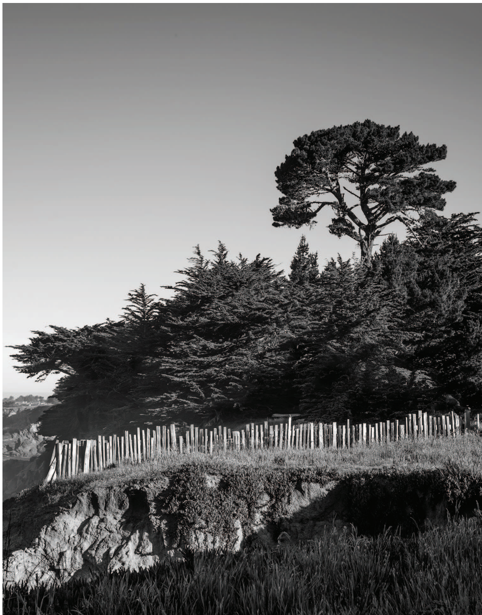
Weathered Fence, Sea Ranch, 2017