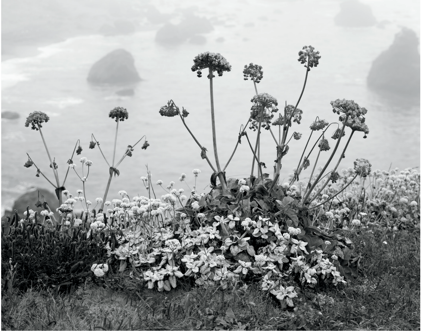
Near Carmet Beach No. 4, Sonoma County, 2019