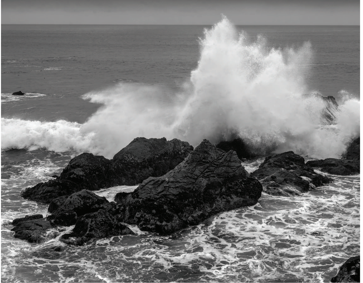
Ocean Surf No. 5, Sonoma Coast, 2018