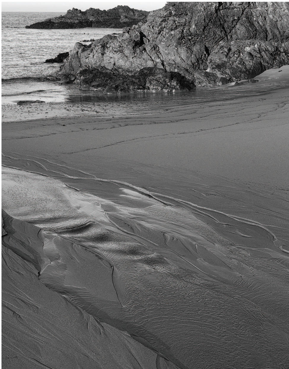
Water and Sand No. 3, Shell Beach, 2019