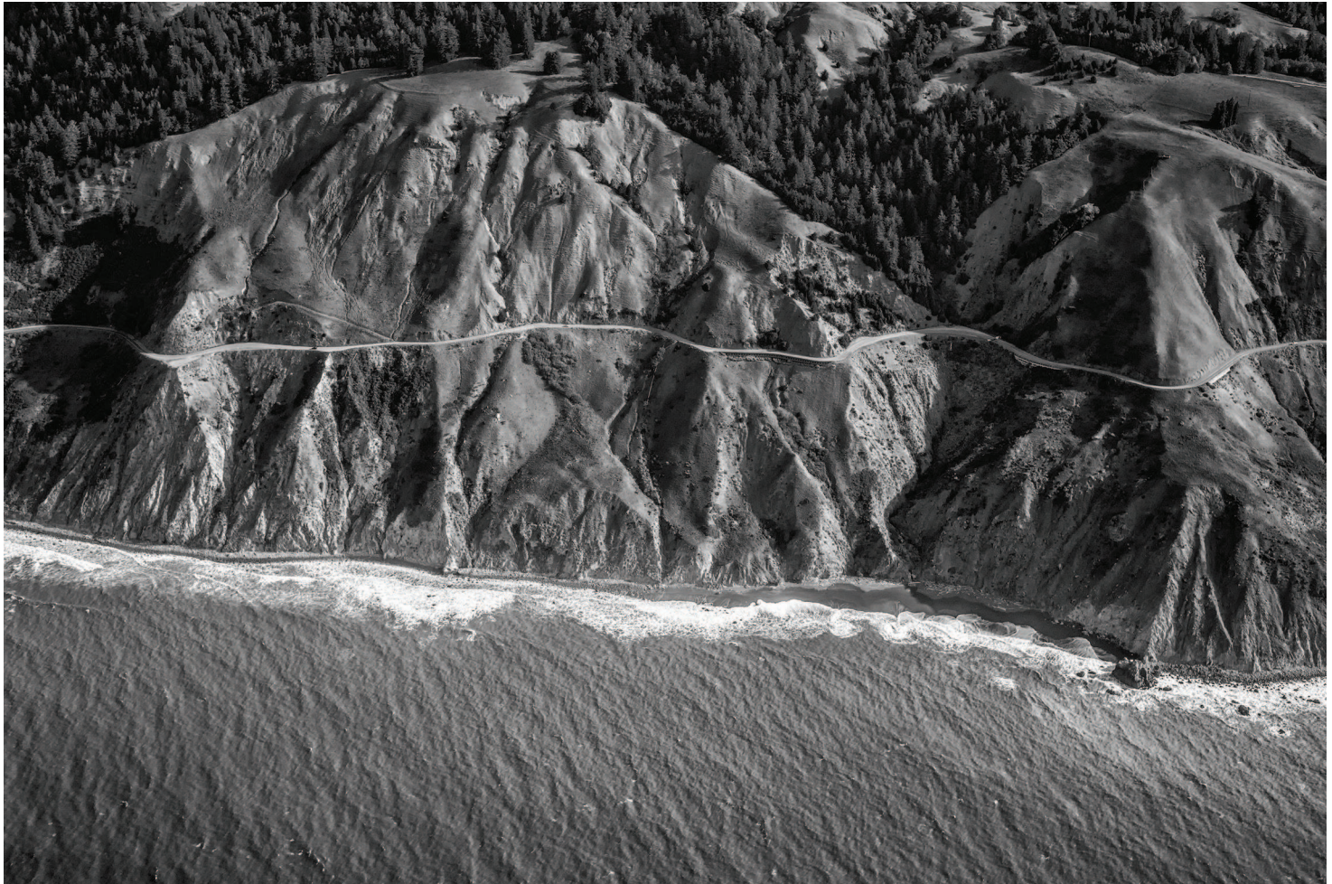
Route 1, Sonoma, 2015