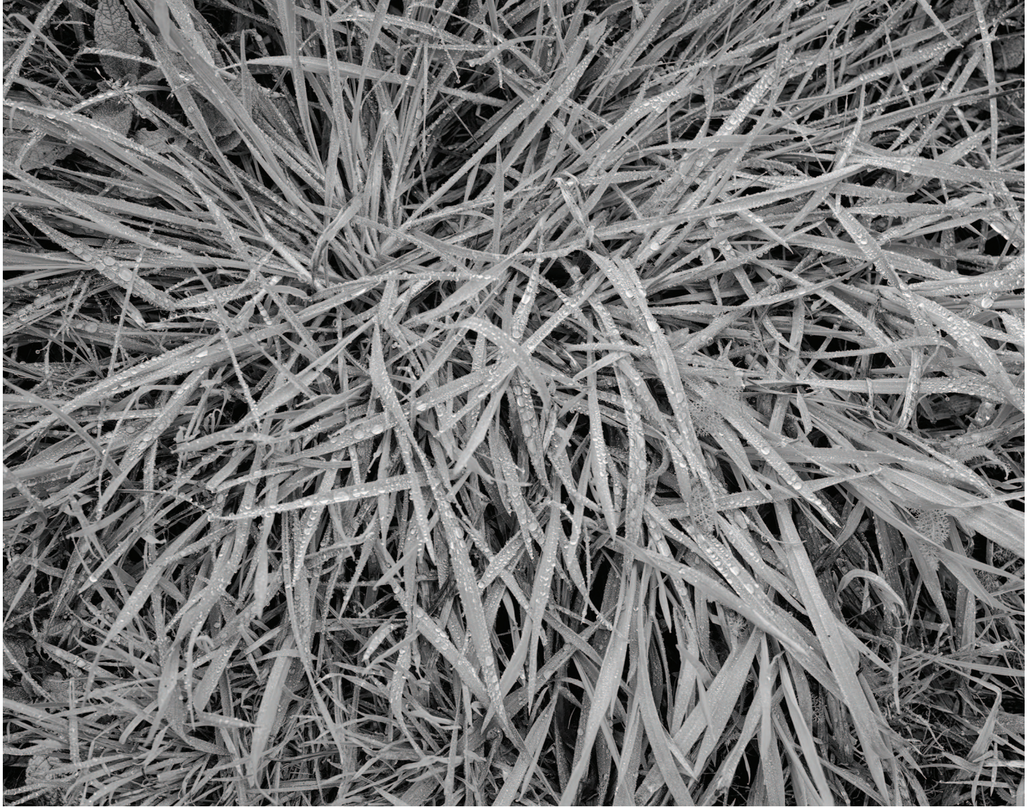
Raindrops on Grass, Sonoma, 2015