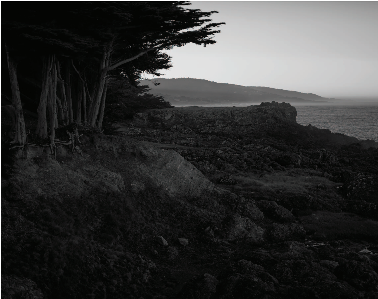
Before Sunrise, Curlew Reach, 2019