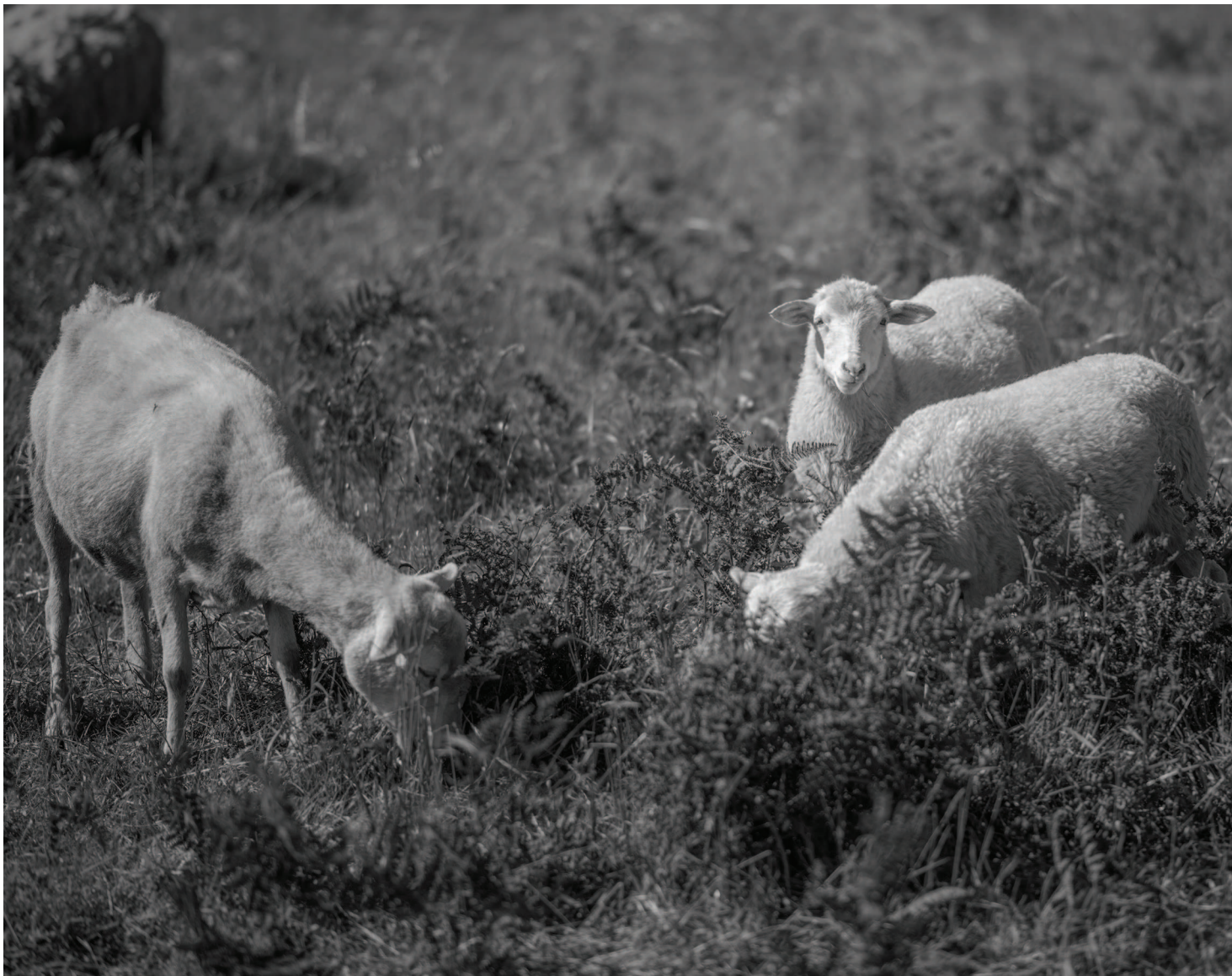
Sheep No. 5, Sea Ranch, 2019