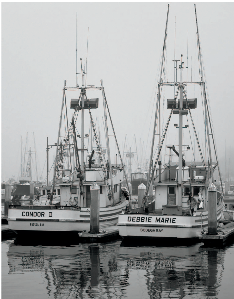
Fishing Boats, Bodega Bay, 2019