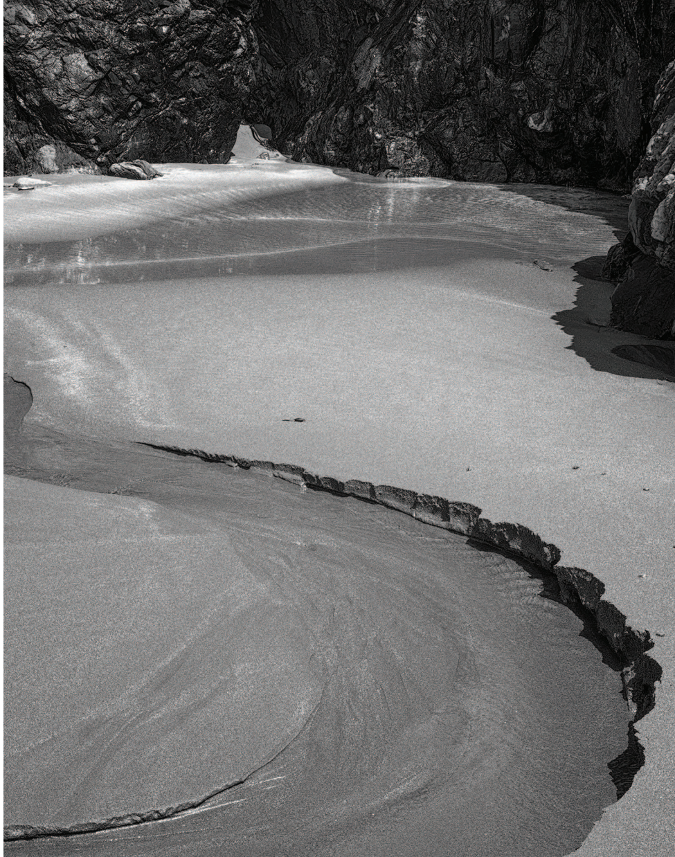
Stream, Sonoma County, 2018