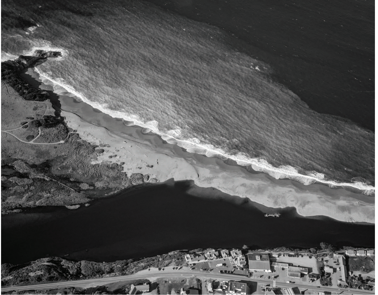
Gualala, Sonoma, 2015