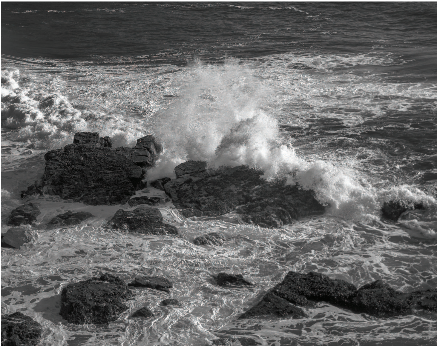
Ocean Surf No. 2, Sonoma Coast, 2018