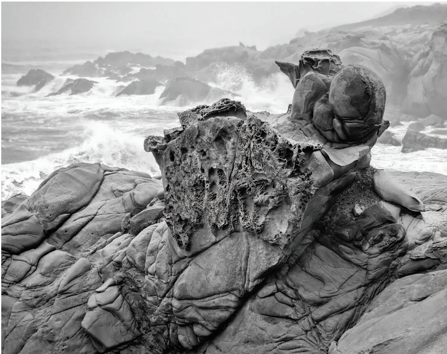
Near Del Mar Point No. 1, Sea Ranch, 2015