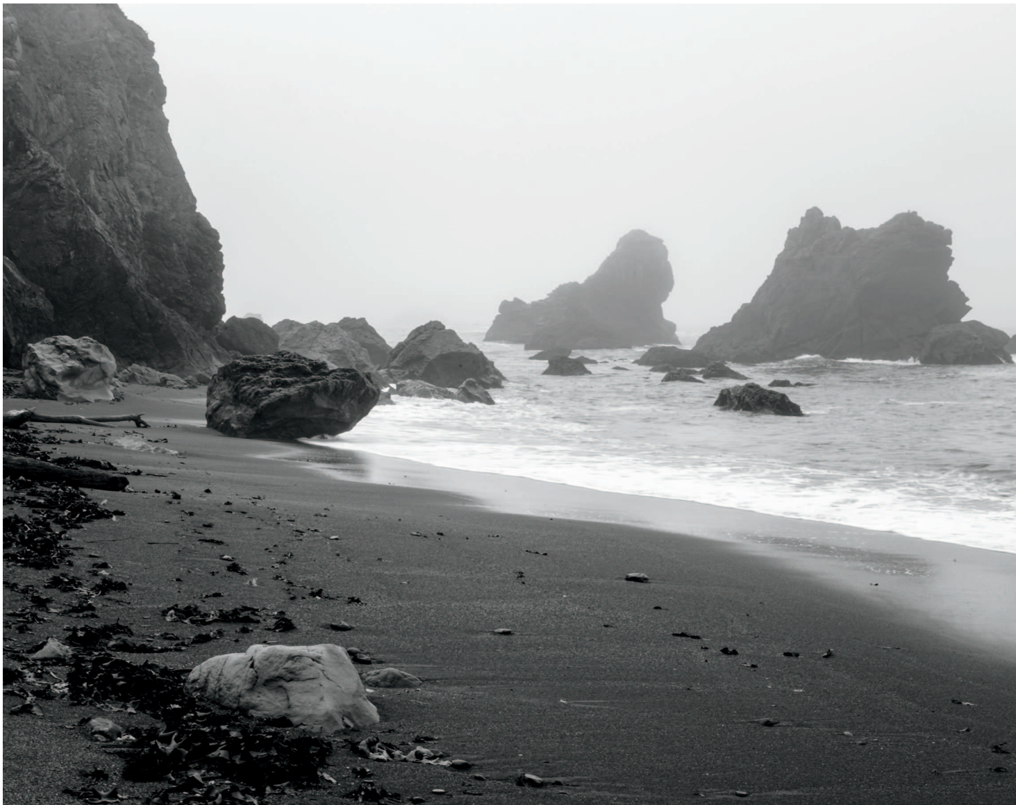
Shell Beach No. 1, Sonoma County, 2019