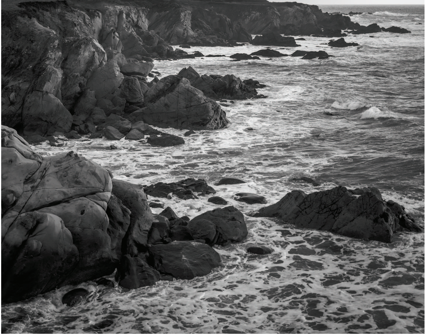
Coastline No. 1, Near Gualala Point, 2018