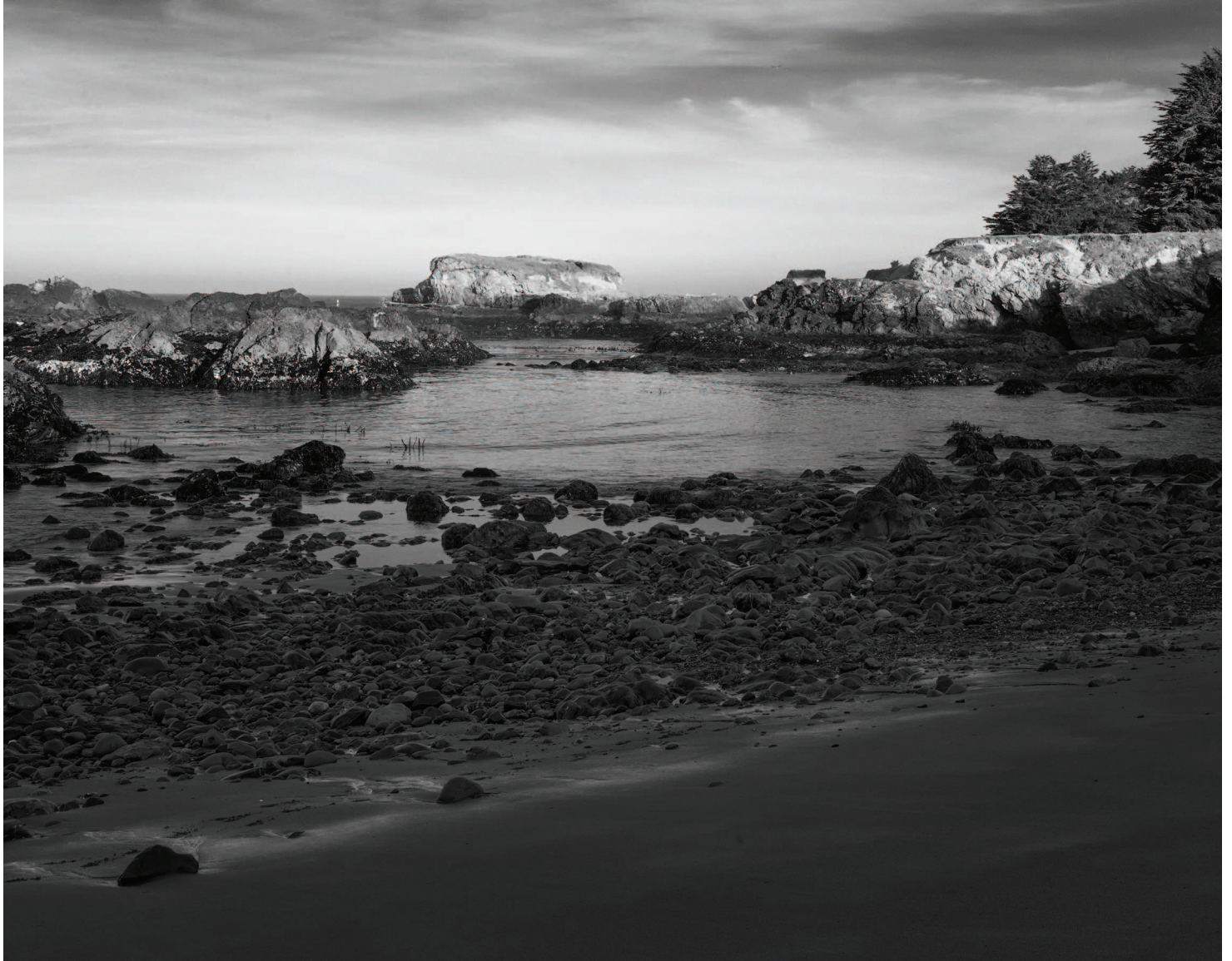
First Light No. 1, Shell Beach, 2019