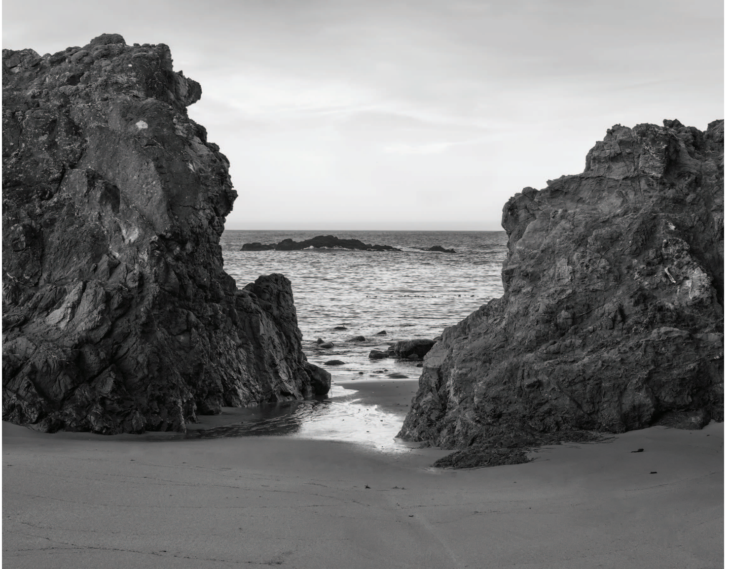
Shell Beach at Sunrise No. 5, 2019