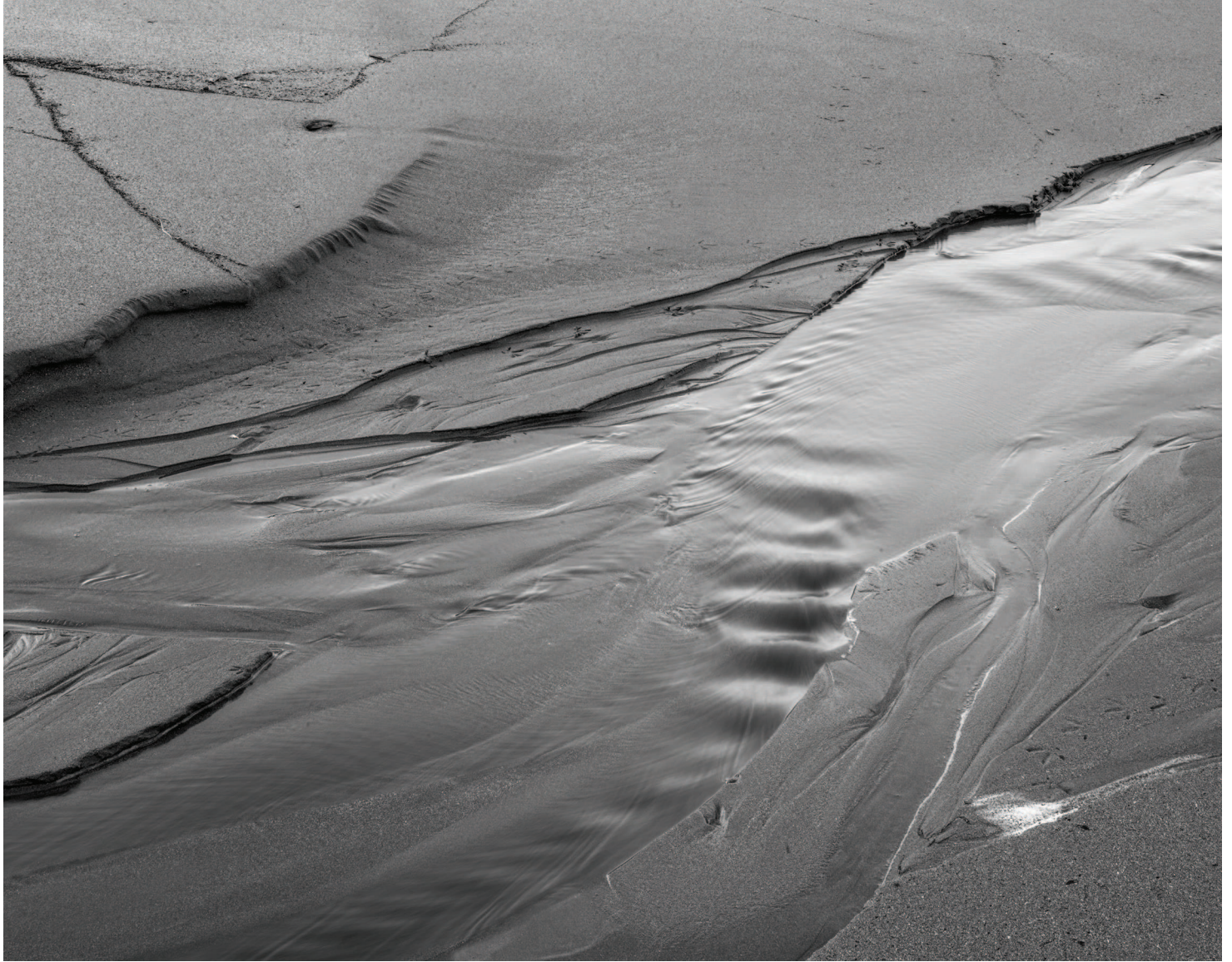
Water and Sand No. 1, Shell Beach, 2019