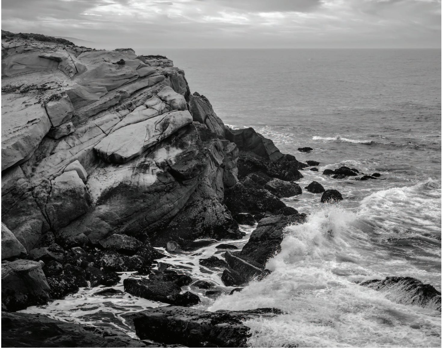
Near Del Mar Point No. 3, Sea Ranch, 2017