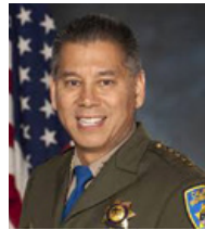
Joseph A. Farrow Commissioner, California Highway Patrol