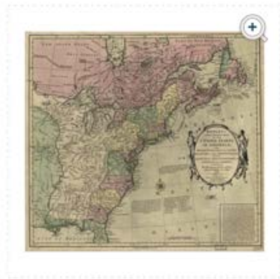
Map of Spanish Louisiana

Born in Spain in 1746, a young Bernardo Vicente Apolinar de Gálvez y Madrid participated in the Spanish army's invasion of Portugal and fought against the Portuguese and their British allies during the Seven Years' War. De Gálvez became a colonel in 1776, the same year America declared independence, and became governor of Spanish-controlled Louisiana on January 1, 1777.