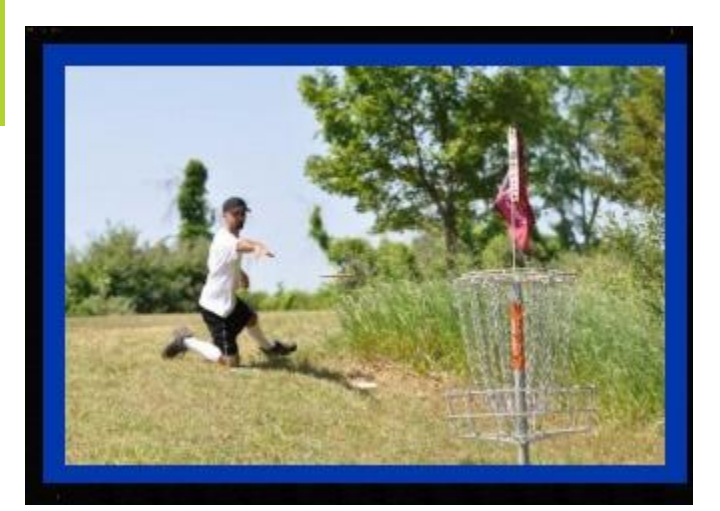
The Rocklin Pro Am Disc Golf Tournament will take place at Johnson Springview Park on July 29-30.