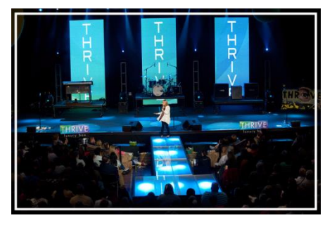
Thrive Women's Conference will be at the Bayside Granite Bay Campus from March 10-11.