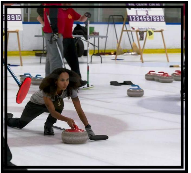
The Barrel Bonspiel returns to Skatetown Ice Arena in Roseville on March 23-25.

January 2018: 69.2% January 2017: 68.3% YTD: 69.2% Prior YTD: 68.3%