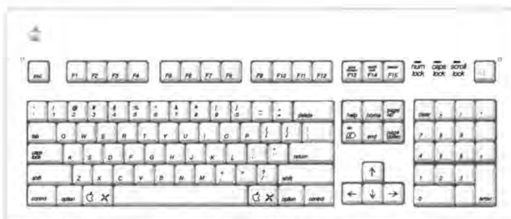
Apple Extended Keyboard.

application n. A program designed to assist in the performance of a specific task, such as word processing, accounting, or inventory management. Compare utility.