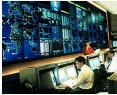
AT&T Network Operations Center, Bedminster, N.J., 1987.