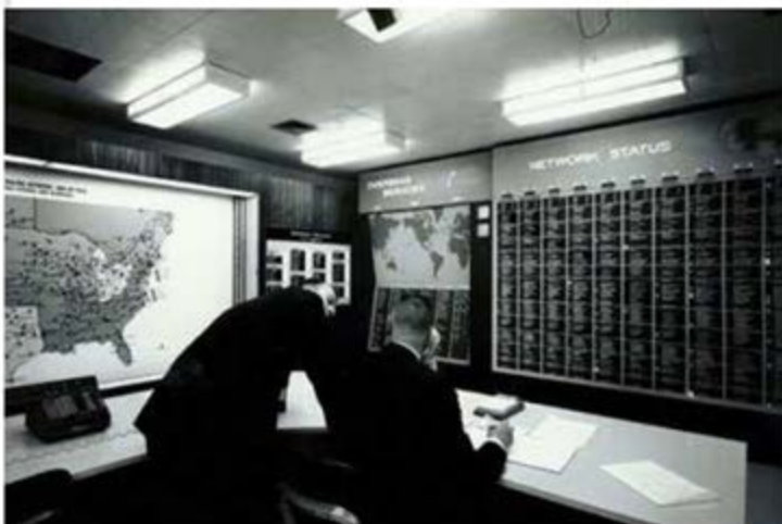
AT&T Network Control Center, New York, 1960s.

45. In the 1970s, AT&T moved to a Network Operations Center (NOC) having domestic and international status boards, which automatically updated every 12 seconds, and computer databases to instantly provide managers with the information needed to reroute calls. By 1987, the centralized AT&T NOC had “a 75-screen video wall where computer-driven support systems provided information on multiple layers and categories of network activity. Managers used computer systems and terminals to find detailed information on any switch or route in the network. They then used those same systems to issue instructions to any place in the network.” A picture of the AT&T NOC in 1987 is provided below. ( See, e.g., http://www.corp.att.com/history .)