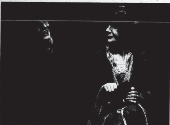
Vanessa Redgrave, left, as Vita Sackville-West and Eileen Atkins as Virginia Woolf in "Vita and Virginia."