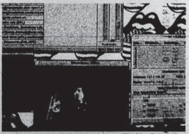
Part of the computer screen showing Mick Jagger's first live appearance on the Internet with the Rolling Stones on Friday.