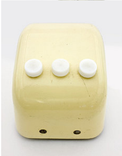
Production-run three-button mouse, serial number 001

The Telefunken Rollkugel may have been the first rolling-ball mouse.