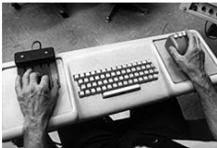
Ergonomic NLS keyboard console

Bill English built the original wooden Engelbart mouse prototype. He is seen here working at an SRI ergonomic workstation.