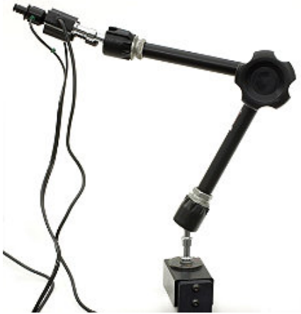
Jouse Sip Puff mouse system

Foot mouse users include people with hand and arm problems, and people who want to keep their hands on the computer keyboard or other control devices.