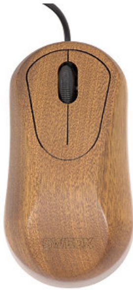
Wooden optical mouse

This wooden mouse combines up-to-date technology with old-world craftsmanship.