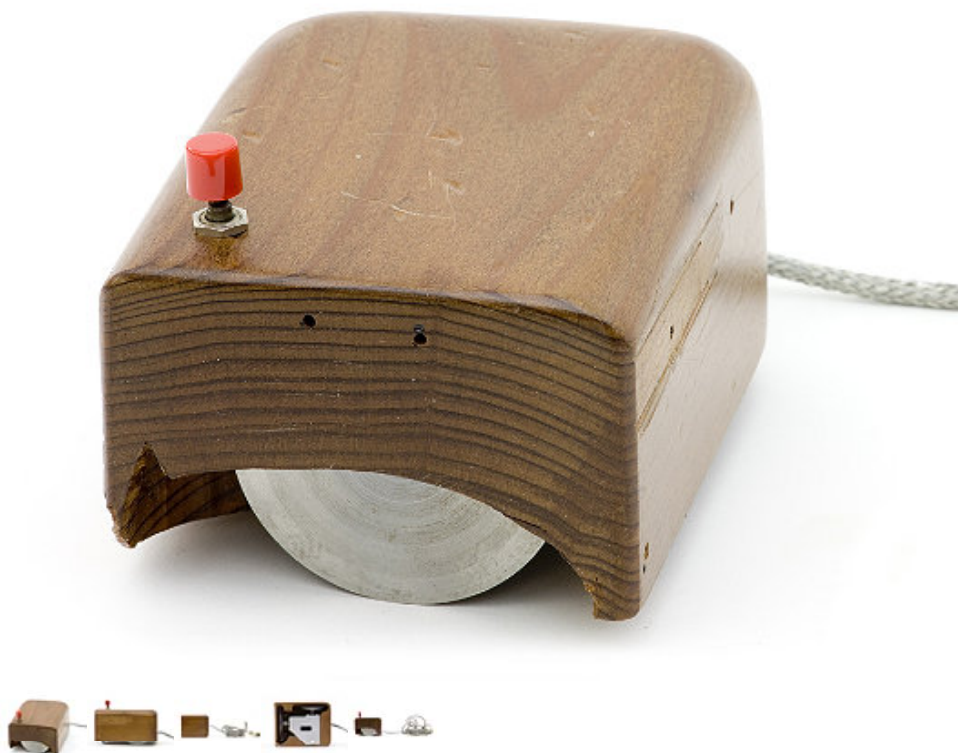
Prototype Engelbart mouse (replica)

SRI engineer Bill English built the first Engelbart mouse prototype, which used knife-edge wheels and had space for only one button.