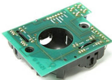
Mouse interior mechanism

This wooden mouse combines up-to-date technology with old-world craftsmanship.