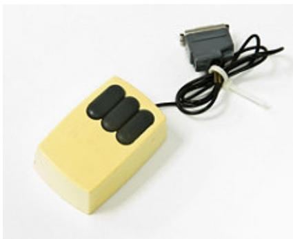
Rolling ball mouse for Alto computer

Engelbart commissioned office furniture maker Herman Miller to build special workstations to hold the chording keyset, conventional keyboard and mouse.