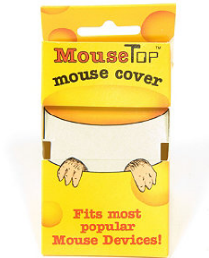
"Mousetop" mouse cover box

Users move this joystick with their mouths. Short inhalations and exhalations signal “mouse clicks.”