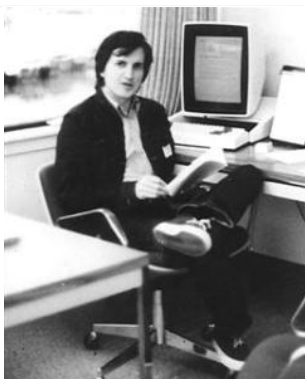
( http://www.computerhistory.org/atchm/content/uploads/2014/02/simonyi_1980 )

Over the next years Word was continually improved. The first version for Microsoft Windows was released in late 1989 at a single-user price of $495. It received a glowing review in Inforworld [8] that didn’t flinch at the price: “If your system is powerful enough to support Microsoft Windows, at $495 it is an excellent value.”