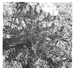
locoweed scarlet locoweed Astragalus coccineus