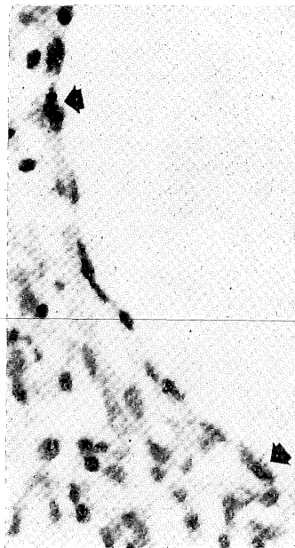
Fig 3 Autoradiograph showing a large dilated thin-walled blood vessel with two labelled endothelial cells (indicated by arrows). H & E. \times 185

From the foregoing it seems that the population kinetics and the histochemical characteristics of the infiltrate both suggest an actively phagocytic role for these cells. The observations also imply intimate vascular participation yet absence of a vasculitis. This interpretation of the data aids in understanding the pathogenesis of the inflammatory reaction in rosacea if some such mechanism as was suggested by Haxthausen (1930) is invoked. He suggested that small cutaneous blood vessels were in some way damaged by exposure to fluctuations of environmental temperature and other climatic stimuli. More elastotic change is found in the biopsies of rosacea patients than in age, sex and site-matched control biopsies (Marks & Harcourt-Webster 1969). Small vessels become dilated in elastotic tissue. If these vessels were in addition in some way injured, for example by cold, they would also become leaky. In rosacea it is possible that as