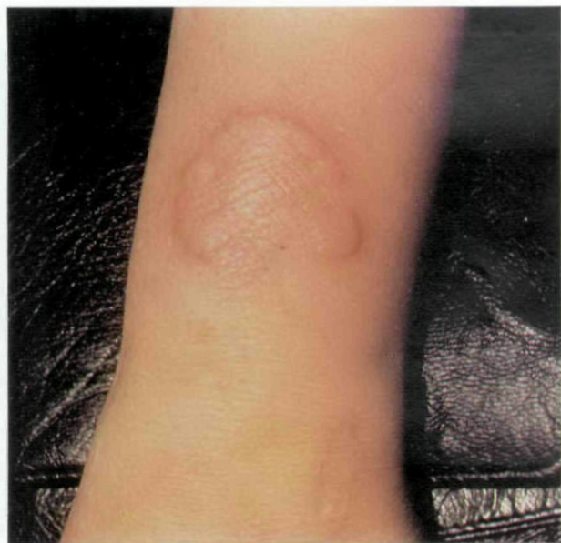
Figure 1. Case 1. Typical lesion of Sweet's syndrome on the left forearm.

to 10 mg daily, she developed multiple, indurated, erythematous plaques surmounted by flaccid blisters.