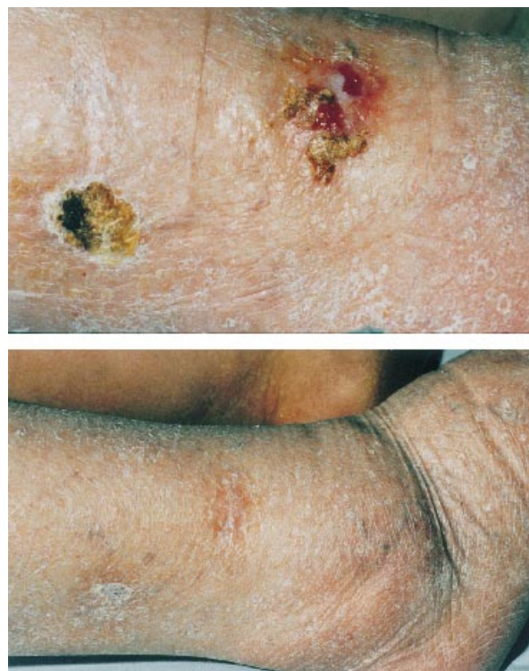
Figure 1. (a) Two areas of Bowen's disease are evident on the lower left leg. (b) The lesions cleared after 3 months of treatment with pulsed 5-fluorouracil cream.

Twenty-six women (mean age 76 years; range 55–95 years) presented with Bowen's disease of the lower leg, present for up to 12 years. The diagnosis was confirmed histologically. The sites of the lesions were recorded and photographed. Patients were instructed to apply 5-FU cream to the lesions in the morning and evening on 1 day each week and given an information sheet that explained the treatment. We emphasized the importance of applying cream to a rim of normal-looking skin around the whole plaque. Treatment