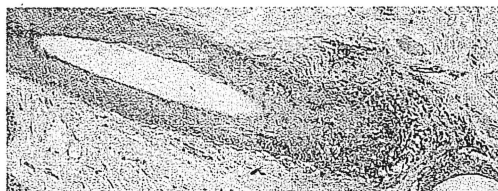
Perifollicular lymphocytic reaction. See page 770.