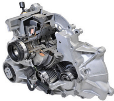
Technology partners: GKN's eAxle module

"You will see quite a few more vehicles with all-wheel drive technology coming to market in the near future," says Rickell. "And there is a definite migration from full-time all-wheel drive systems to on-demand technologies, as drag and friction losses on the latter are much better, improving fuel economy and reducing emissions. The disconnect and reconnection all happens within 300 milliseconds, without any noise, and without any vibration in the vehicle. It's completely seamless," he says.