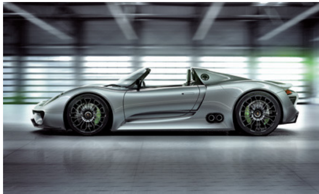
Technology partners: GKN's eAxle module is fitted in the Porsche 918 Spyder

The Porsche 918 Spyder's tight packaging also meant there was almost no air flow around the transmission and so water cooling was needed to manage the heat generated by the module's high power density.