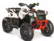
2015 Polaris Scrambler® XP 1000 MSRP: $ 13,299