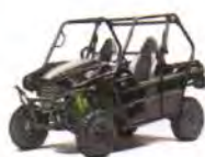
2015 Kawasaki Teryx® Base MSRP: $ 12,999