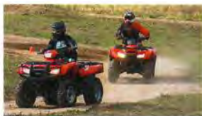
Basic ATV riding techniques