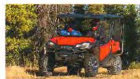
2016 Honda Pioneer 1000-5 Deluxe Review