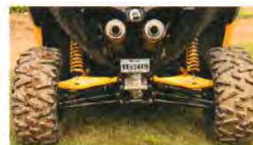
Suspension Setup Tips