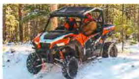
2016 Polaris General 1000 EPS Deluxe Review