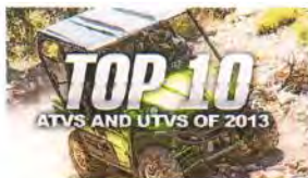
Top 10 ATVs and UTVs of 2013