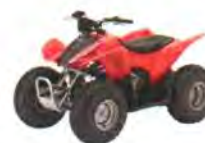
2016 Honda TRX™ 90X MSRP: $ 2,999