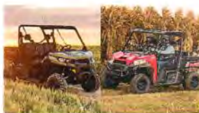
2016 Can-Am Defender vs Polaris Ranger XP 900