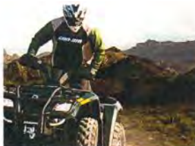
How to keep your ATV young