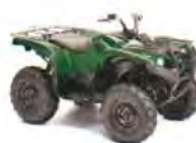
2015 Yamaha Grizzly 700 FI Auto 4x4 MSRP: $ 8,899