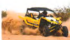
2016 Yamaha YXZ1000R Review