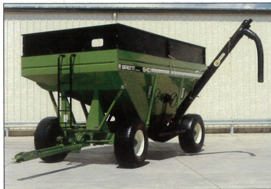
Specifications: Brent Grain Train Wagons