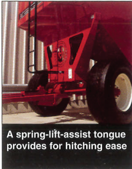
A spring-lift-assist tongue provides for hitching ease