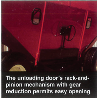
The unloading door's rack-and-pinion mechanism with gear reduction permits easy opening