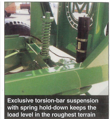
Exclusive torsion-bar suspension with spring hold-down keeps the load level in the roughest terrain

For complete details about the entire line of Unverferth gravity wagons, see your Unverferth dealer today or call 1-800-322-6301.