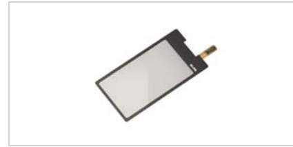
Capacitive Touch Panels

Comfortable, reliable and flexible operation is possible by touching lightly with a fingertip.