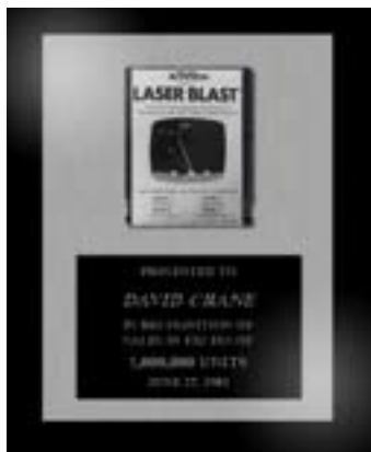
1982 Laser Blast Platinum Cartridge Award, In Recognition of Sales in Excess of 1,000,000 Units