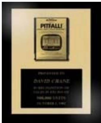
1982 Pitfall! Gold Cartridge Award, In Recognition of Sales in Excess of 500,000 Units