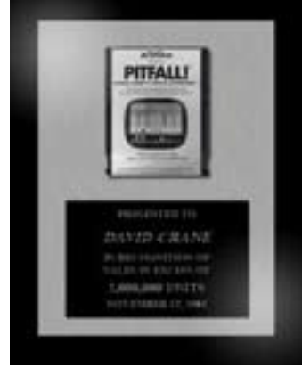
1982 Pitfall! Platinum Cartridge Award, In Recognition of Sales in Excess of 1,000,000 Units