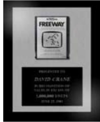
1982 Freeway Platinum Cartridge Award, In Recognition of Sales in Excess of 1,000,000 Units