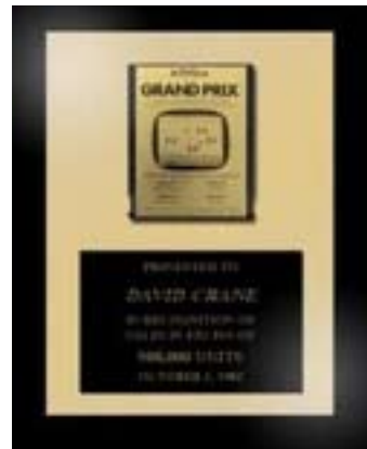
1982 Grand Prix Gold Cartridge Award, In Recognition of Sales in Excess of 500,000 Units