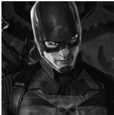
Stan Lee Weighs in on 'Captain America' Hydra Twist