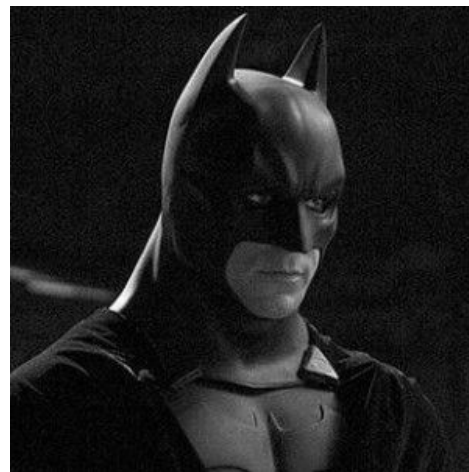
11 Movie Auditions That Led to Breakout Roles