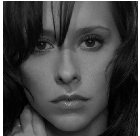
Why Hollywood Won't Cast Jennifer Love Hewitt Anymore