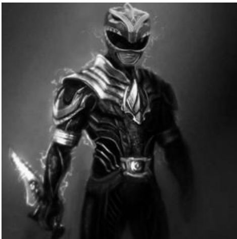
Check Out the 'Power Rangers' New Suits