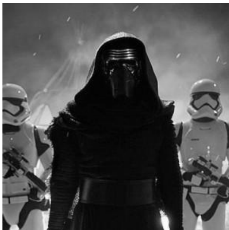
Why Fans Won't Be Disappointed By 'Episode VIII'