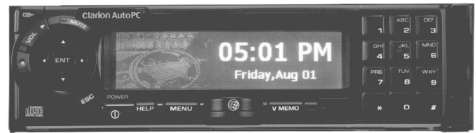
Figure 1. AUTO PC

The Auto PC includes vehicle navigation, digital entertainment, wireless communication and other application software. It provides a safe and efficient user interface including voice recognition and text to speech for hands-free, eyes-free operation. With the optional cellular interface, the user can instruct the in-car multimedia system to dial a contact contained in the Address Book, a contact that could have just been transferred from the user's Handheld PC via infrared data transmission. The user can receive wireless content, such as real time traffic updates, can be pushed to the vehicle via various wireless carriers. A high-end digital audio system with full digital audio processing results in high-quality sound.